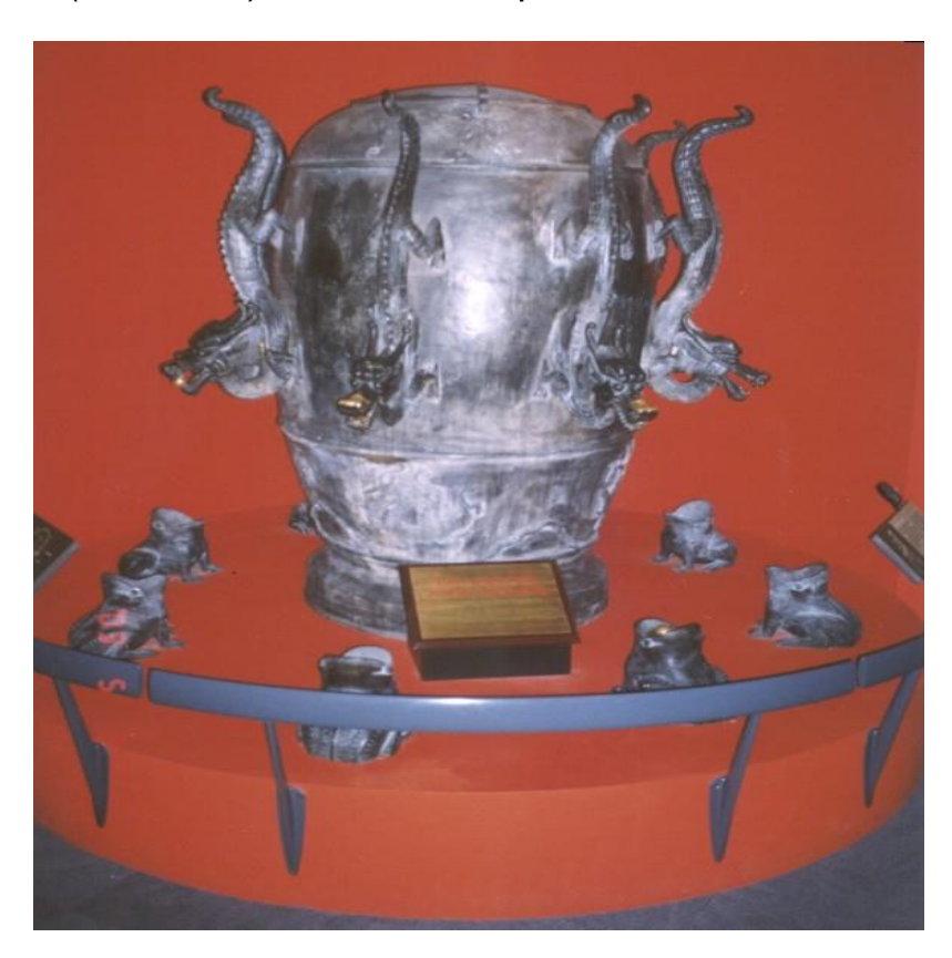
Fig. #H6 (K6 in [1/5]): The above photograph shows an impending earthquakes detector - i.e. a device able to rise alarms before earthquakes strike. Notice that a more comprehensive description of this wonder device is provided on separate web pages seismograph.htm and telepathy.htm .)

dragging this corner upwards-left to receive the size of this different window that you wish to have (notice that since you downsize a fist such a Figure, all next clicked on will appear already downsized - unless you enlarge them in the same way), and then (3) drag this another window with the picture you wish to relocate to the area of this web page where you wish to look at it (to move it you just grab it with your mouse by the blue stripe on the top of it). Notice also that if you scroll (with scroll bars) the text of the page when you read it, this another window (with the drawing) will disappear. In order to return it into the new position, you need to click on its "icon" (name bar) on the lowest part of the screen.