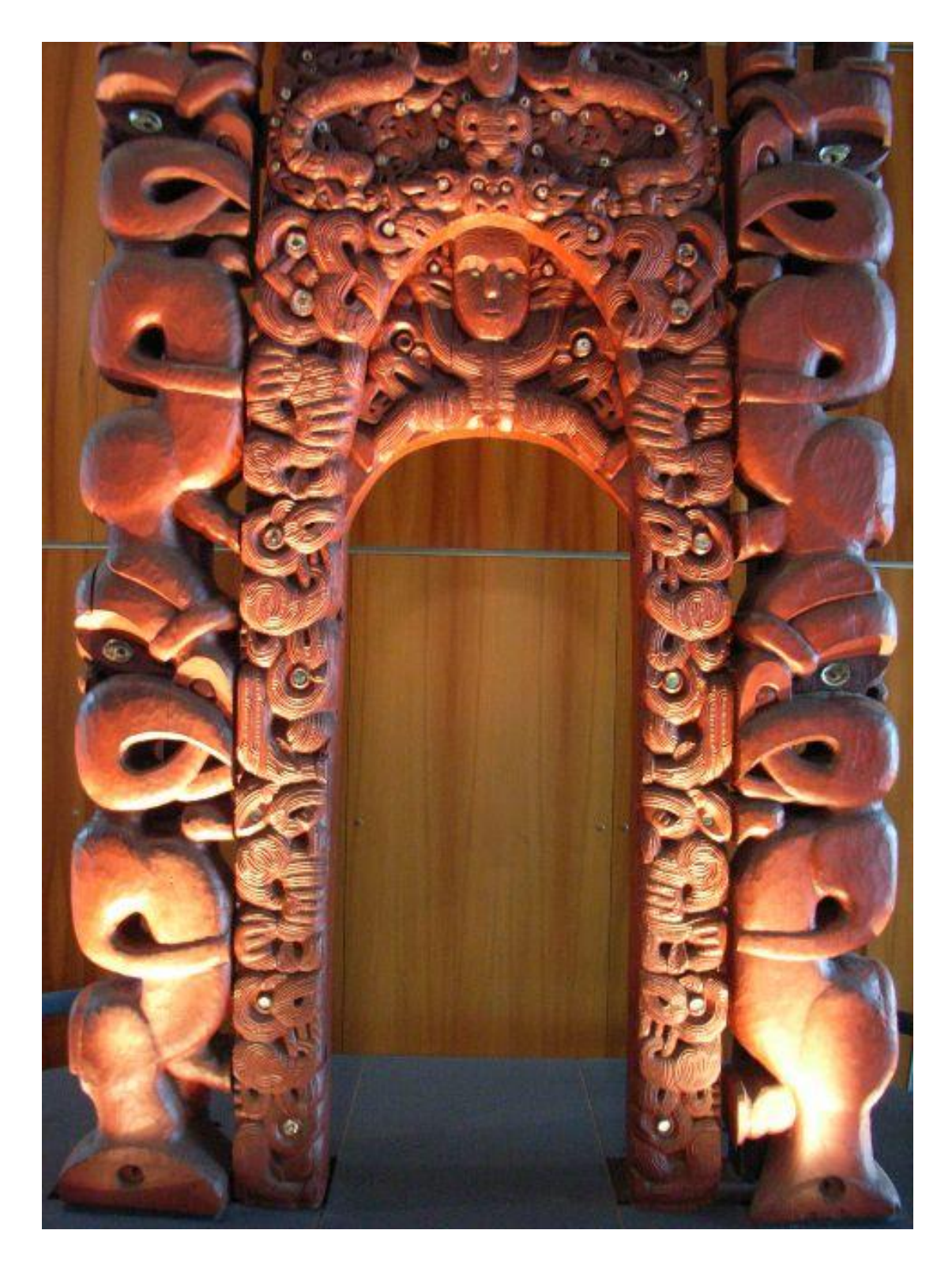
Fig. #D1 : Is it possible that the carving from "Te Papa" shown on the above photograph represents the carved report (repetitively copied until present times) from the public rape of all female inhabitants of Maori village by omnipotent, hostile towards people, and ugly creatures from 3+1 fingered race? After all, creatures of this race were send to the Earth for demonstrating to people "what is evil" and "how evil works". On the other hand it is difficult to find more illustrative, longer held in memories, and simultaneously less fatal for victims kind of evil than the public and group rape of all human females inhabiting a given village, carried out by omnipotent although ugly creatures in sight of fathers, husbands, brothers, and sons of these women. (Click on this photograph to see it enlarged.) The question which arises during viewing carvings similar to the above