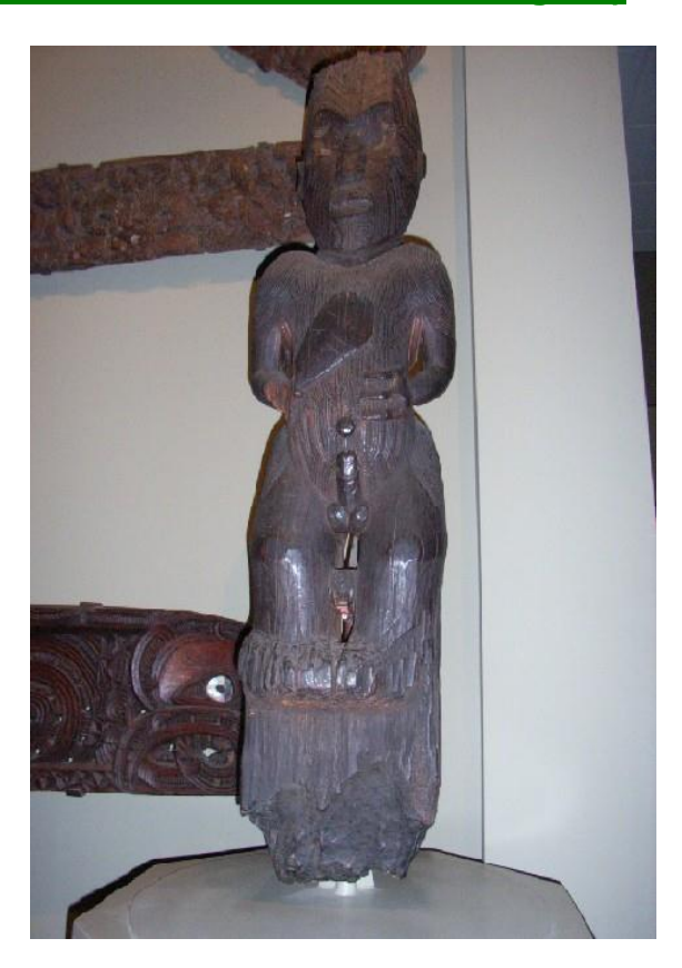
Fig. #L1 : Here is a Maori carving of one amongst these mysterious creatures with mischievous characters, 3+1 fingered hands and feet, continually erected penises, and habits of "sexual maniacs" or "addicts to sex". Although Maori tradition is very laconic about a female version of these creatures, from folklore of other nations we know, that this race had also shapely females (such as the one shown in "Fig. #G2" from the web page named <a href="mailbork_uk.htm">malbork_uk.htm</a>) which also displayed behaviours of "nymphomaniacs". (E.g. traditions of worriers from the tropical jungles of Borneo state, that after getting aroused, these females had the habit to bite-off balls of Earthly man whom they got somewhere in the jungle to rape him.) These creatures belonged to the same race as the Maori god named "Uenuku" - described in item #D1 from this web page. In old times they controlled practically every aspect of life of former Maoris. Maoris consider them to be their "spiritual ancestors" - as this is described in item #D1 above on this web

As my research seems to indicate, these strange 3+1 fingered beings extend their activities NOT only over New Zealand, but also at the entire planet. For #4abc" #6ab" on "Fig. and "Fig. from page sw_andrzej_bobola_uk.htm shown are photographs of sculptures of such beings existing in the South Korea. In time when I was in the South Korea, I noticed how fast and efficiently these beings "organised" the removal of one sculpture of them, which I found in there and photographed. It is also known that such beings were known and acted in Australia - for example in "Fig. 7b" from the web page aliens.htm is shown the appearance of a "bad witch" with 3+1 fingers and toes which originates from the folklore of Australia (Clock here to see the photo of "bad witch" from Australia with 3+1 fingers).