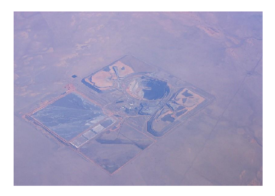
Fig. #J1 . A gigantic hole in the Earth that is formed industrially. It was photographed from the height of around 10 km on 14 July 2008. In order to appreciate how huge it is, it is enough to compare it to the size of white factory buildings that are visible by the edge of it. This hole exists in the north-west part of Queensland, Australia. When the industrial acquiring of minerals is to be ceased in this place, the hole still will remain in there. After all it is too gigantic to bury it out. In turn the existence of it will introduce numerous threats. For example, it is going to be a giant trap for animals and people. It is going to attract criminals and criminal activities. It introduced a so-called "carb" to the Earth's crust, from which with the elapse of time the fault line may develop (means may develop the crack in the Earth's crust which becomes the initial point of earthquakes). It is also going to make this area ugly forever. Local authorities are going to have constant headache with it, as they will NOT know what to do and how to secure it. Etc., etc. (Click on this photograph to see it enlarged.)

In matters of nature people can either far-sightedly, productively, and wisely prevent its destruction, or thoughtlessly destroy it first and only then wake up "oops - we need to salvage whatever is still left". Although in a purely theoretical manner inhabitants of Antipodes vigorously discuss the matter of necessity to protect the natural environment, as so-far their actions are limited to mainly such theoretical discussions. Also, as so-far in their relationship towards nature one can see typical for Antipodes behaviours, means a lot of force, but not much knowledge, wisdom, and far-sighting. (For example, I never saw any other country in which the erosion of life-giving black soil would be so advanced as in New Zealand - e.g. check item #B1 on the web page landslips.htm.)