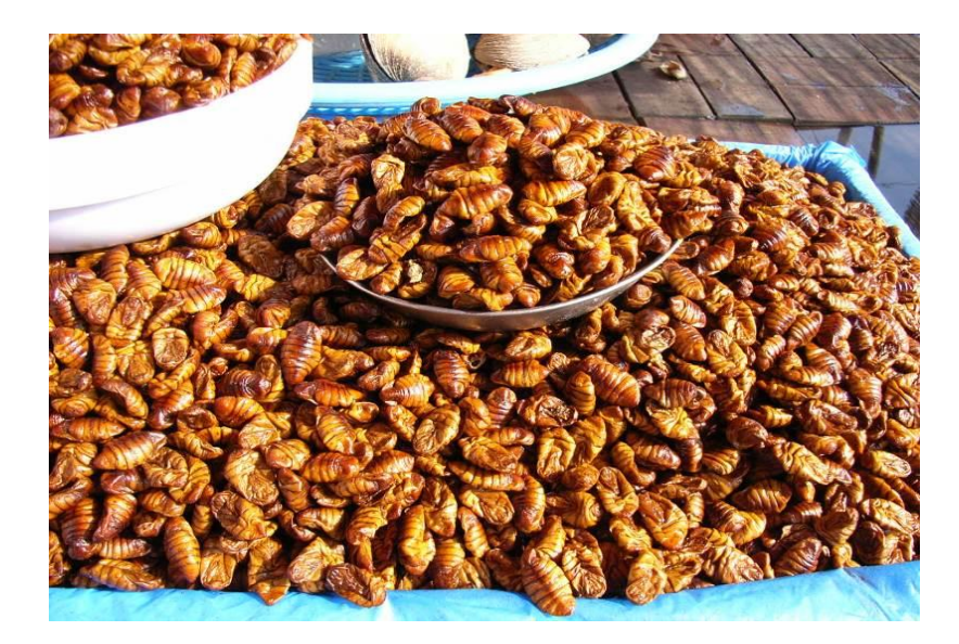
Fig. #2: Here are dried "silkworm pupa". These are used in the folklore healing of Korea for centuries or perhaps even for thousands of years. These pupas already now provide healing accomplishments similar to the ones which only lately are promised by so-called "stem cells" that the official human medicine started to research not long ago. This means that "silkworm pupas" are able to regenerate damaged cells and tissues. Unofficial folklore of Korea claims that such "silkworm pupas" are able to heal a whole array of malignant illnesses.

For reasons which I explained more accurately on other web pages, e.g. on web pages <u>memorial.htm - about methods of suppressing specific research</u> or <u>evil.htm - about sources of evil on the Earth</u>, research on utilisation of "stem cells" are pushed forward behind the scene in spite that in many cases this research induce various moral objections. On the other hand silkworm pupa carry in themselves mechanisms of action which allow to accomplish without any "moral hangover" and almost immediately practically all the same healing effects that immorally are promised by researchers of "stem cells". Unfortunately, no-one currently carries out research on healing mechanisms of silkworm pupa. Therefore, at this point I have an appeal to the readers, to morally enforce wherever they can the initiation of research on healing mechanisms that hide in these humble silkworm pupa. Our civilisation would benefit from such research, not mentioning about moral tortures of these ill people who in the future will be aware that in order to recover their own health they need to deny the right to live to some other potential human.