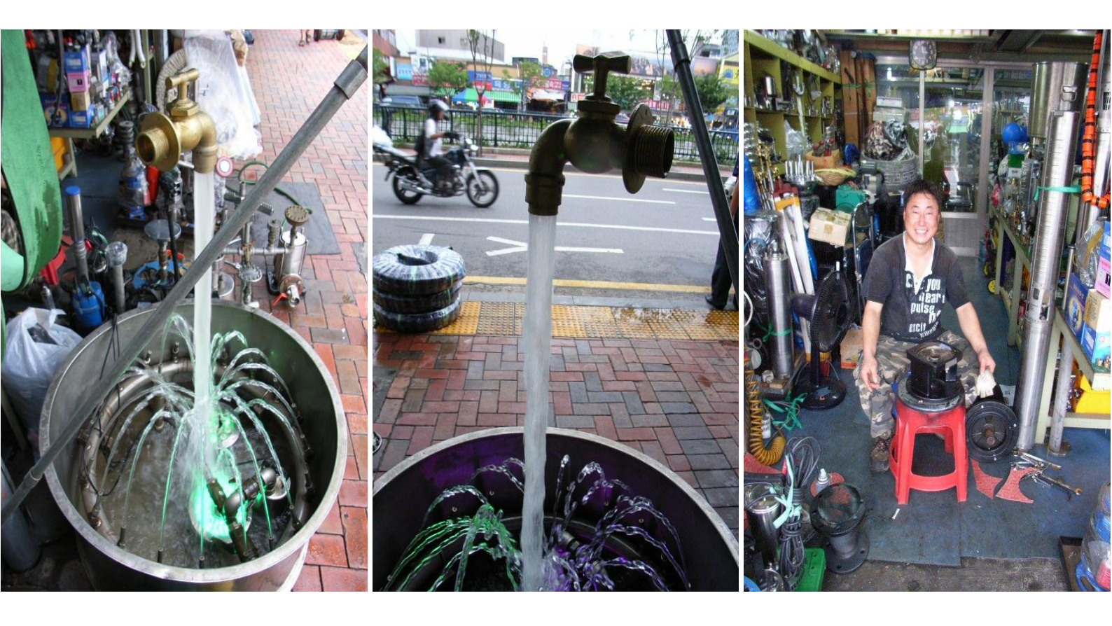
Fig. #6abc: Koreans are technical geniuses. For example above I am showing photograph of a "tap which levitates" and which is pouring water while hovering in the thin air. This tap is used as an effective advertisement for technical skills of the owner of a small workshop at the entrance of which it was exhibited. The operation of this tap is hypnotizing passers by, attracting to the workshop many new clients. I myself could NOT resists to photograph this tap and I did not leave this workshop for as long as it took me to work out on what principles this tap works and "levitates".

Fig. #6a (left): Here is the photograph of this "levitating tap" shown from the direction of footpath. In fact this tap looks like a fountain, only that it pours water from top towards down, instead - like a fountain, from down to top. On the background we can see the owner of the workshop who utilises this tap as an efficient advertisement for his technical skills. Close-up photograph of the same "levitating tap" can be seen if we click on this "green" writing .