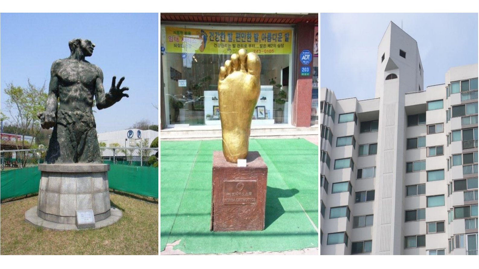
Fig. #7abc: Photographs that document Korean sense of humour. Fig. #7a (left): We call them "half-heads" (in Polish: "półgłówki"). Our country overflows with them. But in Korea they are so rare, that most clearly they are immortalised on monuments (or perhaps sculpturists have no custom to buy more cement when they run out of it before finishing a given sculpture).

Koreans have very refined sense of humour. Below I am showing several photographic examples of it.