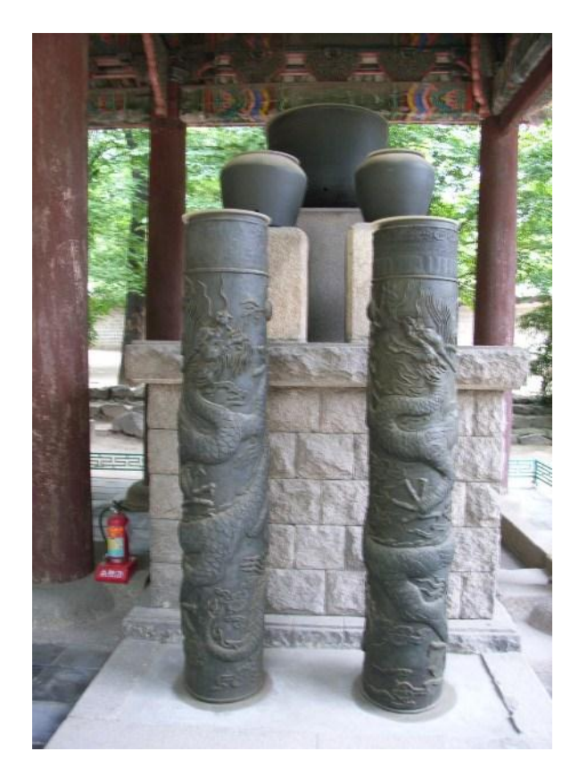
Fig. #5: The oldest and the largest water clock of the world, or more strictly what remains of it until today. It is exhibited in the king's palace "Deoksugung" from Seoul. This clock automatically and fluently was

The everyday use of technology can shock in Korea. In fact, as so far, I have not met a nation the everyday life of which would be saturated with such a large number of technical gadgets as the life of a typical Korean. Of course, I did NOT live yet in every country of the world, e.g. I did NOT live in Japan yet, so perhaps there are nations even more saturated with technology than Koreans are. But Koreans are incomparably greater consumers of modern technology that all other nations that I know of (i.e. than Poles, Germans, Swiss, New Zealanders, Australians, Malaysians, Singaporeans, Cypriots, and also neighbours of these relatively well known to me nations). As I also noticed, from the point of view of practical skills in the use of modern technology, my Korean students would "eat for breakfast" students from all other countries that I lectured so-far.