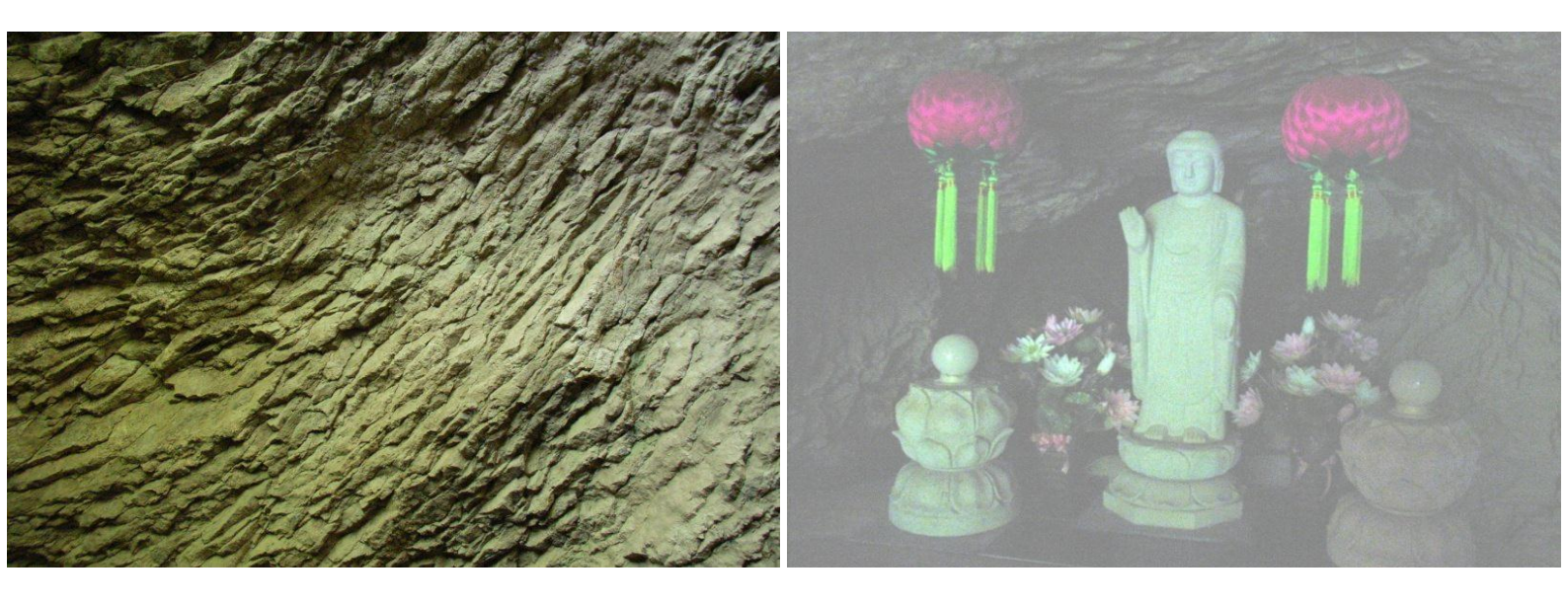
Fig. #11bc: Two photographs which document two different manners of formation of the "Jin Cave" shown and described on the previous photograph "Fig. #11".

Fig. #11b (left): A close-up photograph of the side walls of the "Jin Cave". It reveals that the "Jin Cave" was formed due to precise carving (breaking out) native rocks with the use of telekinetic pressure.