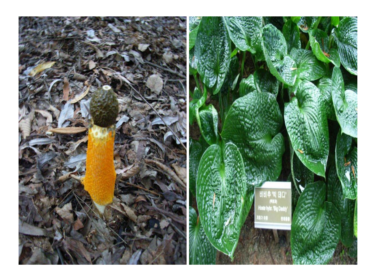
Fig. #8abc: Photographs which show more extraordinary flora of Korea.

Fig. #8a (left): Here is the illustration how strange can be flora of Korea. For example, almost everyone knows that in Korea grows a root called "gin-seng", the shape of which resembles approximately a human body. This root has parts the positioning and location resembles the corpse, head, hands, and legs in humans. Surprisingly, this root "gin-seng" displays also healing properties. But not many are aware that in Korea grows an extraordinary mushroom, recorded on the above photograph, the size and appearance of which also resembles something human. Interestingly, the above mushroom I photographed in the king's palace "Changgyeonggung" in Seoul. While walking through the park of this palace, I saw a group of scientists who with a great interest studied something on the ground. When I approached them in order to check what it is, I saw the above mushroom. Supposedly it is an extraordinary rarity. The scientists who studied it gave me even its scientific name, but I forgotten it. I know that in