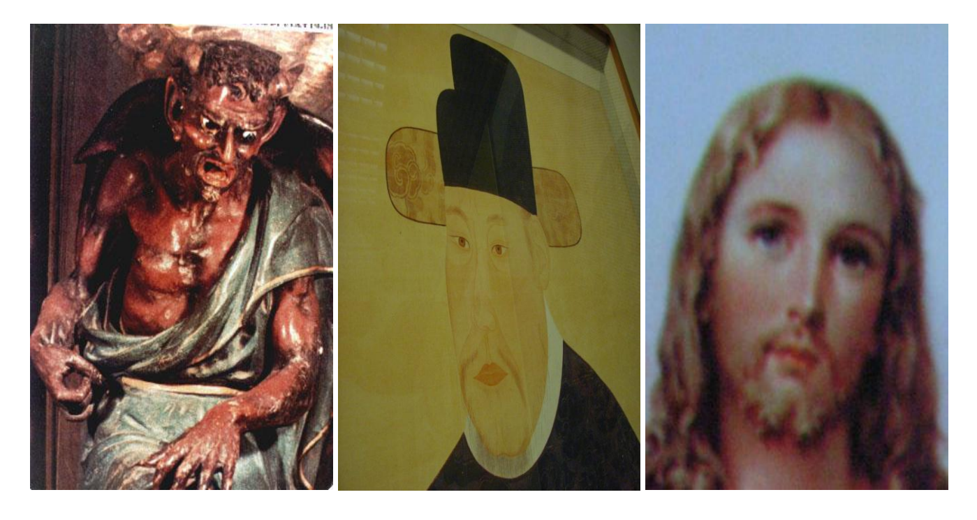
Fig. #D1abc: Photographs that illustrate different manners on which this buttocklike protrusion on chins of UFOnauts can manifest itself. In combination with e.g. curled hair (like in <u>Sai Baba</u>), or hair growing upwards on the scull, this buttocklike protrusion represent one of the most visible anatomic details which allow to distinguish UFOnauts from people. After all, typically it does NOT appear on chins of people born on the Earth.

oppressors that are arriving to Earth in their invisible UFO vehicles.