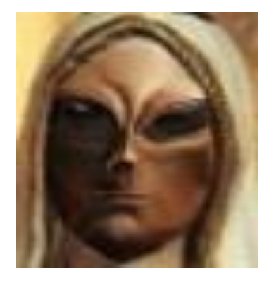
Fig. #E1: In order to hide the fact that they are almost identical to us, the UFOnauts on official missions always wear masks. I wonder whether the