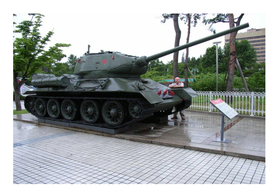
Fig. #E1.1: The above photograph shows a tank named T-34 from the Soviet Army. The person photographed with it is me, i.e. Dr Jan Pajak. Such T-34 tanks were ones which won the Second World War. Just such tanks like the above one were rolling over streets of Milicz during the "battle of Milicz". Folklore stories claim that just such a tank was destroyed with an "iron-clad fist" ("Panzerfaust") at the moment when it was entering the central square of Milicz. The burned skeleton of it was supposedly later haunting for some time at the entrance to Milicz central square in a small street that leads fo the square from the castle. In turn the crew of it, which was burned alive, rests buried in Milicz. (Click on this photograph to see it enlarged.)

practice, that all operational parameters of Russian tanks, which are vital in battles, always are superior in comparison to similar parameters of other tanks. In turn when the Second World War is concerned, then even the most biased experts have serious difficulties with avoiding to acknowledge, that the Russian tanks "T-34" were then the best tanks in the world, and in reality these were them that won that war.