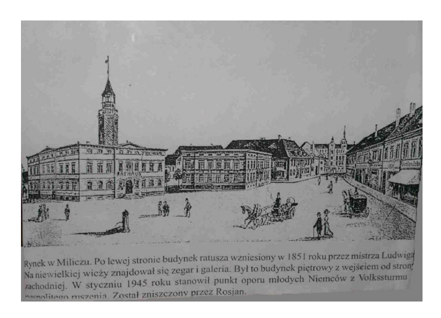
Fig. #D1: The appearance of the town-hall from Milicz, build in 1851.

shown in photographs from "Fig. #D1" of this web page (which is the repetition of the photograph "Fig. #28" from web page about the town of <u>Milicz</u>.) Unfortunately, this town-hall was destroyed during the liberation of Milicz by the Red Army.