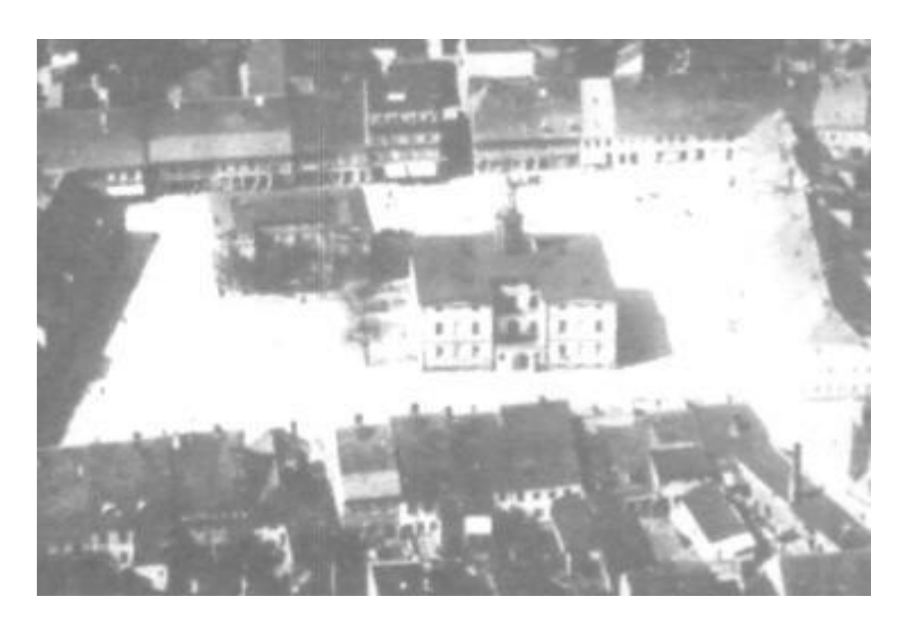
Fig. #C2: Appearance of the central square and town-hall from Milicz, captured in the overhead view looking from east towards west. (From German postcard of 1936, courtesy "Miliczanin-1931".) In the building of town-hall clearly visible are these public toilets on its eastern side, which low-located roof tempted young German "defenders" of Milicz in their attempts to run for life during bombardment of the town-hall by Russian cannons - as this is described in item #C1 above. The actual existence of these toilets with low roof, documented on this photograph, confirms the truth and correctness of the report from item #C1 above. (The report from item #C1 was prepared and published in February 2009, while the above photograph was found and scanned only in May 2010.)