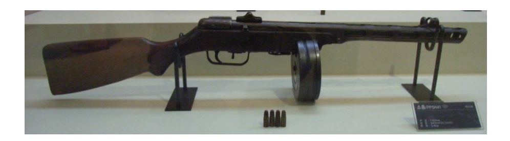
Fig. #E2: The machine gun of the Russian army <u>PPSh-41</u> from times of the Second World War. It was known under a popular name "pepesha". It was just from such a "pepesha" that were executed the young "defenders of Milicz" in German military uniforms, which in 1945 barricaded themselves in the townhall

In spite of natural for Germans technical genius, in the Second World War the quality of personal weapons of Germans was decisively inferior in comparison to the quality of Russian personal weapons. For example, Germans tried to win the war with the help of a hand reloaded, single shot rifles which were designed almost a half of century earlier! But it turned out that such rifles were useful only in shooting to unarmed prisoners. However, when confronting Russian soldiers armed with excellent "pepesha" machine guns, this single shot rifles gave almost no chances to Germans to survive these confrontations.