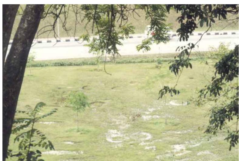
<u>Fig. W1</u>. UFO landing sites under my windows . This illustration presents photographs of UFO landing sites that were left under my windows, by UFO vehicles that constantly watch my every single movement.

( Upper ) The rhomboidal scorching of grass that originates from the inner chamber of the main propulsor of a K6 type UFO. It was left under windows of my flat on 13 Princess Street, Timaru, New Zealand. This photograph was taken on 10 February 2001, but then the landing was already several months old. Both diagonal axes of this rhomb were around 46x72 cm. The long axis (72 cm) was oriented in a magnetic North-South direction, while the short axis (46 cm) was oriented in an East-West direction. This means that the square outlet from the inner chamber in the main propulsor of UFOs type K6 has the side dimension equal to around a=46 cm. (This dimension is also confirmed by the square scorching with the side dimension around a=46 cm, which I found in 1992 in the centre of a K6 UFO landing from Alford Forest near Ashburton – I described this UFO landing in subsection VB4.3.1.) But when the above K6 UFO hovered above my flat in Timaru, the main propulsor was slated at the angle of almost 45 degrees in a North-South direction in relationship to the ground level (My bedroom was around 10 meters to the North from this scorched mark.) This is why the scorched mark is rhomboidal, not square.