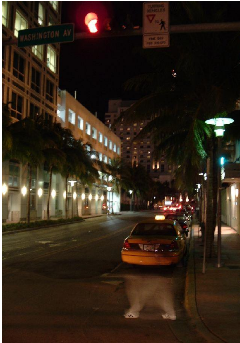
Fig. #D7 (E4 in [10]): Here is a photograph which managed to capture someone only partially visible from the belt to the ground, and completely invisible from the belt upwards. This someone was captured when he crossed a street with a "normal length of stride" between the camera and a taxi that stood by the side of road. (For a better examining this photograph please click on it to enlarge it.)

This photograph illustrates relatively well how these partially transparent human figures, as well as these human shapes flying in the air looked like, that in times of my living in Wrocław were seen on the "Wzgórze Partyzantów" relatively frequent. Probably they are active over there even today. Only that "modern" people, who today see them, most surely interpret them according to today's intellectual atmosphere - which "condemns" everything that mysterious and "explains" rationally such unexplained facts just as "human imagination".