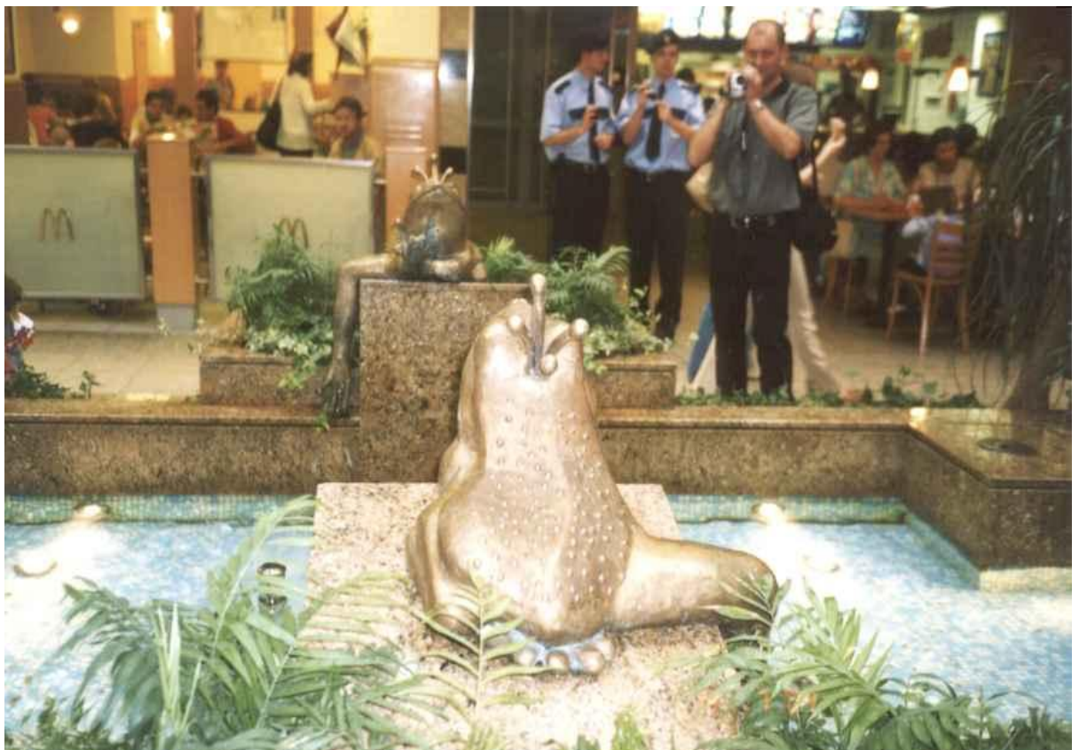
Fig. #D19: On the foreground a sculpture of a frog (the first one, out of two) which is placed by the fountain on zero level of the most popular (in 2004) supermarket of Wrocław, called the "Galeria Dominikańska" (another frog is visible on the

The curious aspect of Wrocław was, that in past it also had symbols that defined its polarity. These symbols seems to continue their action until today.