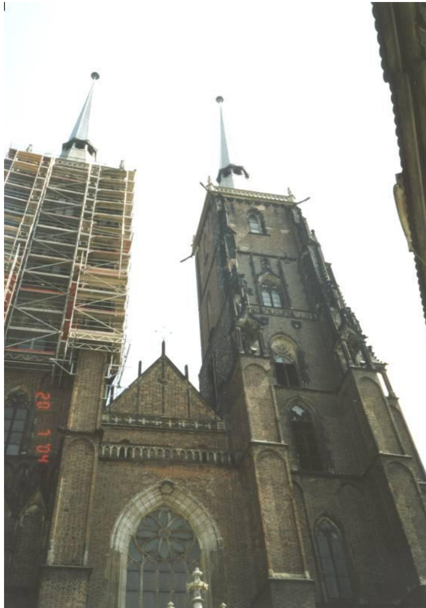
Fig. #D1: This is a photograph of Wroclaw Cathedral (founded by the Polish king Boleslav Chrobry, in 1000 AD). It originally was erected on the presently non-existing island named "Dominsel" from the old flow of the Odra river. This cathedral was the most significant source of the power, growth and prosperity of Wroclaw. Please take notice of two silver discs that imitate UFO vehicles of the second generation, that are visible on tips of cones from tops of both towers. The above photograph was taken in July 2004, when the age of this cathedral already exceeded 1004 years.