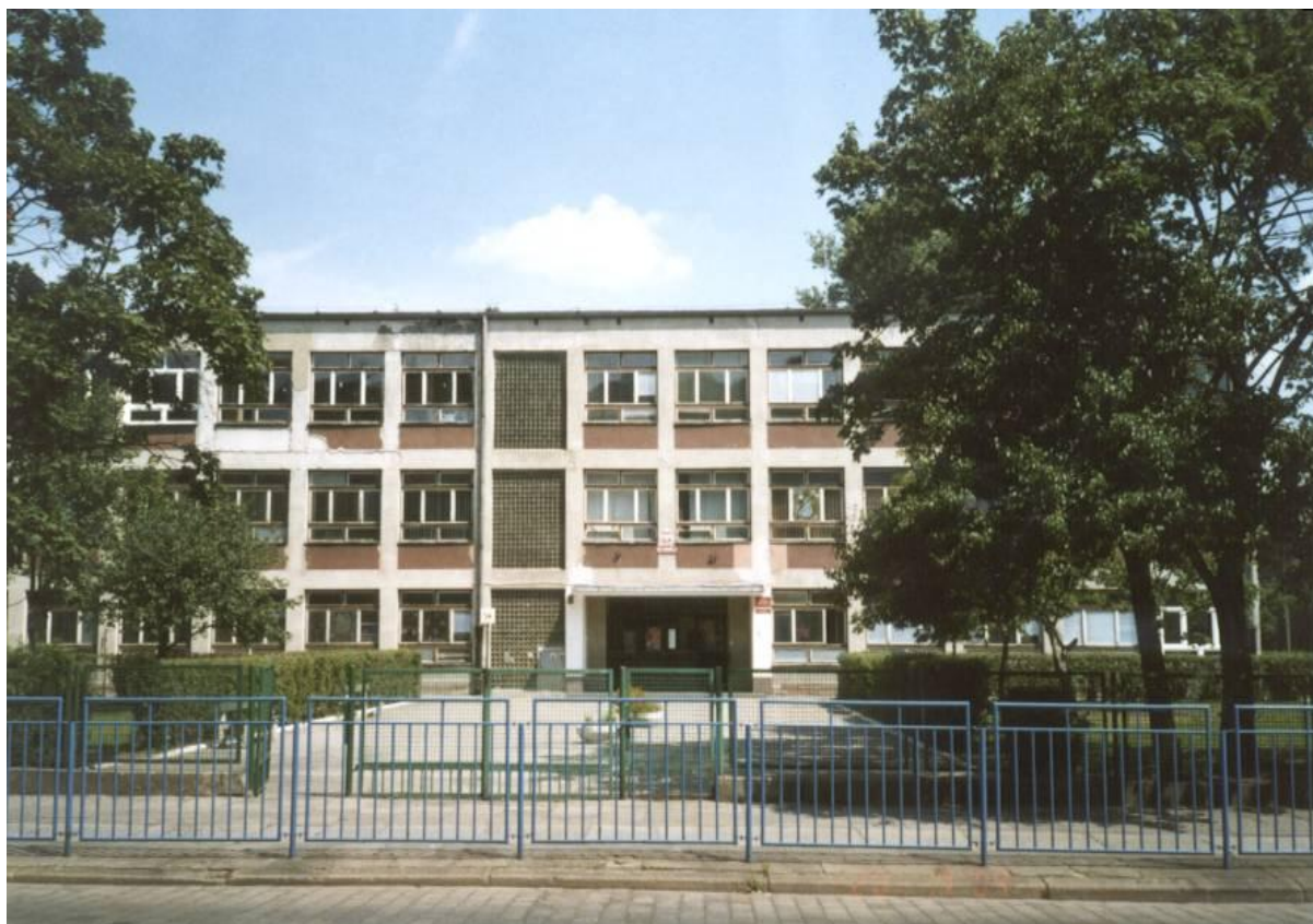
Fig. #D12: The school from Museum Square. In times before the World War Two, on the place which now is occupied by this school, the former Museum of Wrocław used to stand. It was during the dismantling of that museum that a treasure was discovered in the form of a container with gold coins. Before authorities learned about his treasure and managed to secure the location of it, the entire treasure mysteriously vanished.

this tower. Inside he found a room filled up completely with gold and precious stones. When immediately afterwards the government of communistic Poland send trucks to take this treasure, it was so much of it, that it filled up completely several trucks. What happened later with this treasure after it was taken by the government, citizens of Strzelin were unable to tell - there were persisting rumours that it was redirected to private pockets. The question which I always had, was whether this treasure from the tower in Strzelin had been the same treasure which in last days of the war was shipped out from the Bank of Wrocław.