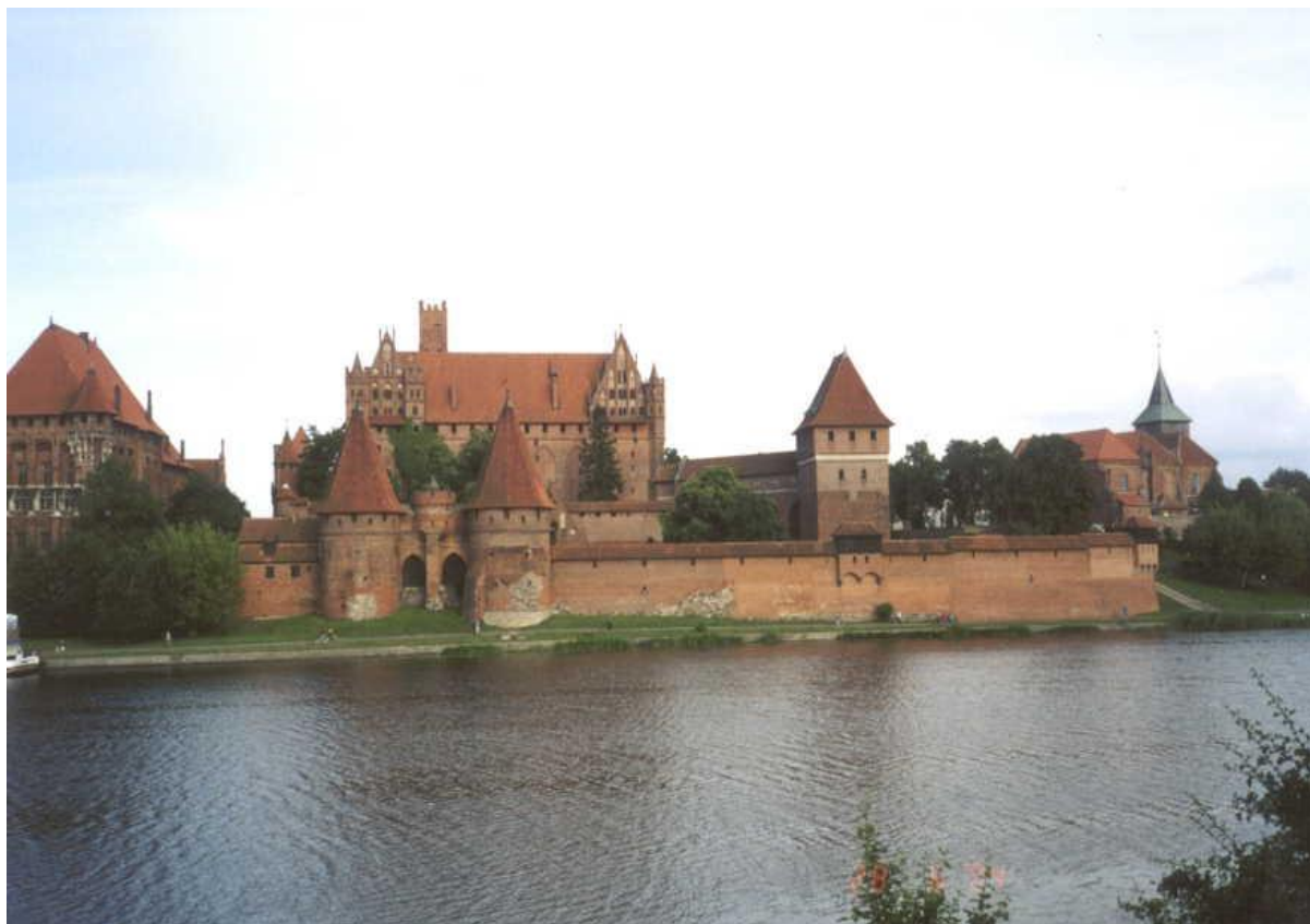
Fig. #D11: Here is how most probably fortification walls of Wrocław used to look like. These walls were constructed from bricks, although in various areas they

When Napoleon entered the Wrocław city, he called the mayor of this city and asked him to explain "why there were no cannon salutes to greet me?" In reply to this question the mayor of the Wrocław city instantly make a long speech addressed to Napoleon. In this speech he pedantically explained 12 vital reasons for which the city did not greet so eminent visitor with cannon salutes. The last out of these 12 vital reasons was "because here in Wrocław we do NOT have cannons". Napoleon took to heart this speech, because he suspected that the mayor of Wrocław city was scoffing at his "military intelligence" in a highly diplomatic and well hidden manner. So in order to even the score and to show who actually is the boss, Napoleon ordered to dismantle the fortification walls of Wrocław. He also left at the Wrocław's keeping his occupational garrison, supposedly to make sure that the dismantling of the walls was completed thoroughly. But it somehow happened that this garrison was supposedly composed of the greatest drinkers, the most egger womanisers, the most impulsive fighters, and the biggest eaters, from the entire Napoleon's army.