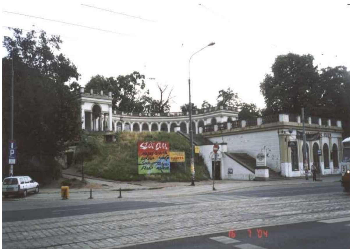
Fig. #D6: The so-called "Wzgórze Partyzantów" in Wrocław (in past called "Bastion Sakwowy" - means "Treasure Fort"). It is under this old fort that

The parking of UFO vehicles in chambers of large underground caves is only one amongst numerous ways of hiding the continuous presence and activities of UFOonauts on Earth. Other, almost the same frequent manner of hiding of these creatures from people is changing for a given person an UFOonaut surgically likened to this person. Such UFOonauts changed for specific people in old times were called changelings . In turn, a different way of hiding whole UFO vehicles from people by UFOonauts, depends on surrounding these vehicles with technically formed clouds or fogs. Such " UFO-clouds " display a whole range of interesting attributes, which are described in more details on a separate web page about "UFO-clouds" available via " Menu 2 ". For example, all other clouds around them continually drift pushed by winds, while these clouds stand in one place as if they are "anchored" over there. After some time, instead of floating away as other clouds do, these clouds simply vanish into nothingness and disappear from the view. Furthermore, they have shapes similar to UFOs. In order to get familiar with their shapes I suggest to look at the web page about cloud-UFOs .