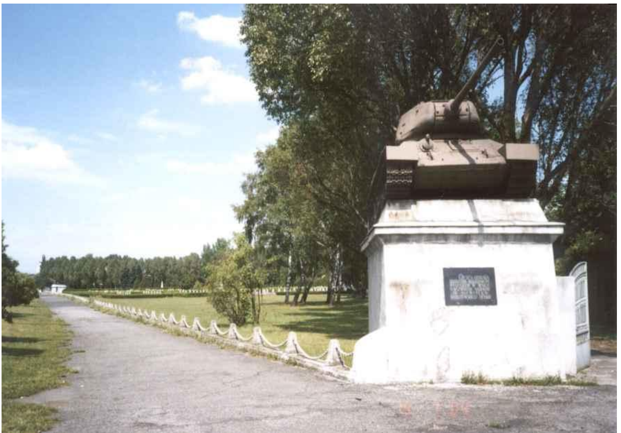
Fig. #D15: The cemetery of Russian soldiers from Wrocław. Thousands of these soldiers were killed during the liberation of Wrocław.

Wrocław has many of old cemeteries. The most meaningful out of these is the cemetery of Russian soldiers. They died so that Wrocław could become what it is now. I wonder how many of us remembers about this fact, is aware what and where would be if not the death of these (and others similar to them) soldiers, and shows a gratefulness to these fighters for our freedom by placing sometimes a symbolic flower on the graves of some of them, or saying a prayer for their intention. We must remember, that none of these soldiers had a choice neither where and when was born, nor who was to be the leader of his country, nor where and when he comes to die. Each one of us could, and still can, find himself or herself in their position.