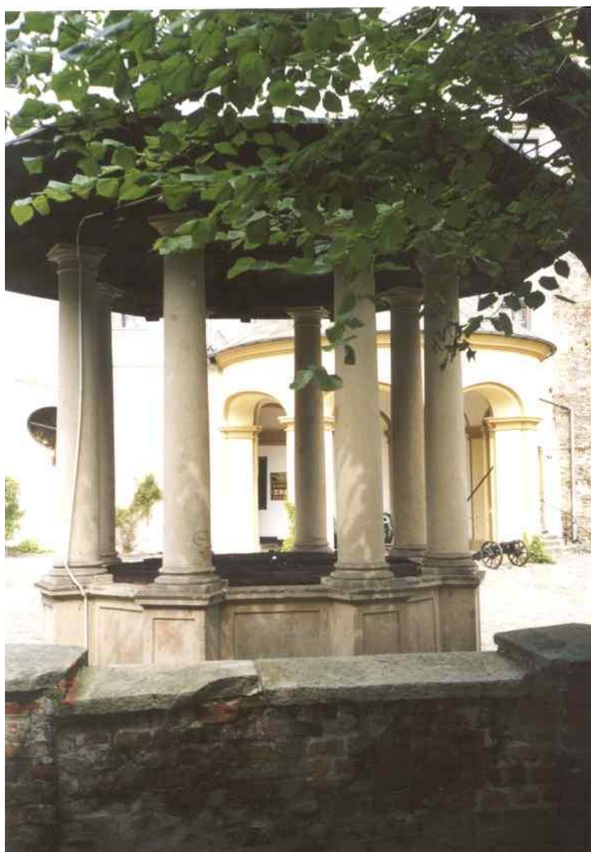
Fig. #D4: The castle's well from Otmuchów in Southern Poland (i.e. less than 100 kilometres to south from Wrocław). The photograph was taken in July 2004. When one looks inside of this well then can clearly see the entrance to underground tunnels and cellars from this castle. In turn these tunnels always had at least one exit located in forests far beyond the reach of walls of the castle and town.

such wells from castles contain these entrances to underground tunnels. For example, such entrances are in wells from: (1) the high castle in Malbork (this with the sculpture of a "pelican"), (2) the castle in Otmuchów, south of Wrocław - see "Fig. #D4" below (from this well in Otmuchów, tunnels run as far as the fort in Kłodzko), and also (3) the castle of Teutonic Knights in Gniew (Northern Poland). In fact, every old fortified castle, including the castle in Wrocław, almost for sure used to have a well on the yard (i.e. in the castle's "keep"), with an entrance to underground tunnels. Only that in present times we usually do not know where these wells used to be located.