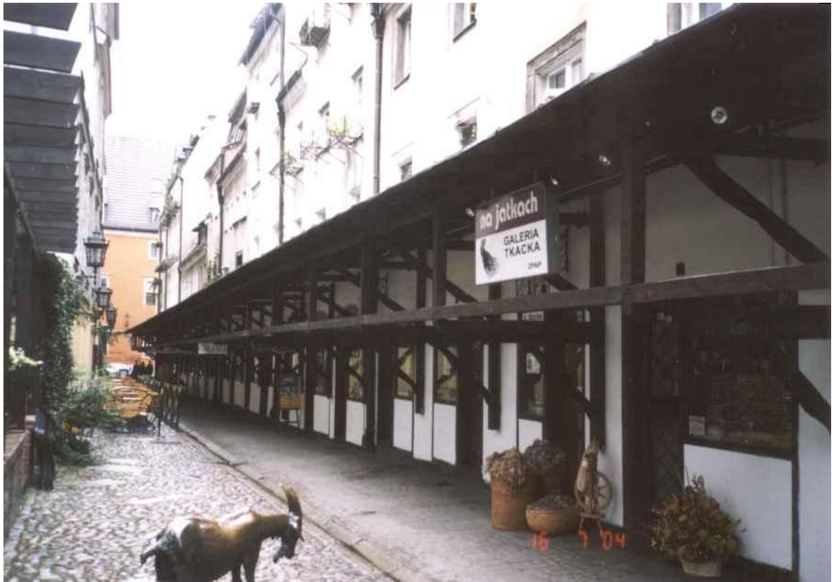
Fig. #D8: The oldest street of Wrocław, called "Jatki". (The photograph taken in July 2004.)