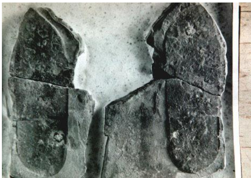
Fig. #F1: Here is an imprint of human shoe, which is around 550 millions years old. Similarly like present simulations of "devils" (or "UFOonauts") this shoe imprint is a part of a larger "test" to which is subjected at present the