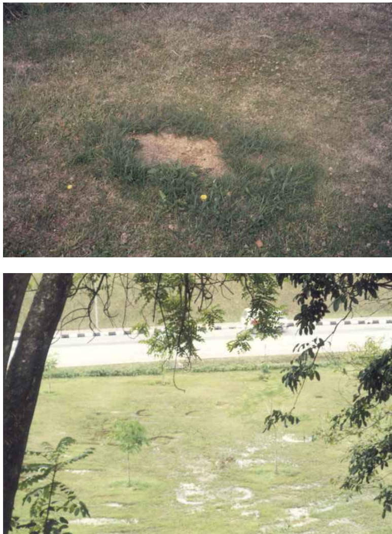
Fig. W1. UFO landing sites under my windows. This illustration presents photographs of UFO landing sites that were left under my windows, by UFO vehicles that constantly watch my every single movement.

(Upper) The rhomboidal scorching of grass that originates from the inner chamber of the main propulsor of a K6 type UFO. It was left under windows of my flat on 13 Princess Street, Timaru, New Zealand. This photograph was taken on 10 February 2001, but then the landing was already several months old. Both diagonal axes of this rhomb were around 46x72 cm. The long axis (72 cm) was oriented in a magnetic North-South direction, while the short axis (46 cm) was oriented in an East-West direction. This means that the square outlet from the inner chamber in the main propulsor of UFOs type K6 has the side dimension equal to around a=46 cm. (This dimension is also confirmed by the square scorching with the side dimension around a=46 cm, which I found in 1992 in the centre of a K6 UFO landing from Alford Forest near Ashburton – I described this UFO landing in subsection VB4.3.1.) But when the above K6 UFO hovered above my flat in Timaru, the main propulsor was slanted at the angle of almost 45 degrees in a North-South direction in relationship to the ground level (My bedroom was around 10 meters to the North from this scorched mark.) This is why the scorched mark is rhomboidal, not square.