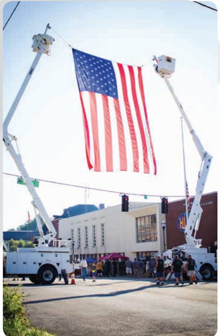
HUB and the City of Harriman Fire Department purchased this large flag which became a focal point for everyone attending Hooray for Harriman!

As we move into the third decade of the new millennium, your HUB will continue to foster an enhanced community through exceptional service!