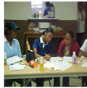
Students work on college essay writing activity

The first phase of the program consists of four Saturday sessions where current college students and recent college graduates cover a number of topics. The youth are first encouraged to define who they are, what they believe, and what they enjoy. Based on this analysis a career assessment is conducted to pinpoint ideal career choices for each student. The next three sessions concentrate on setting goals, researching different colleges, filling out college applications, writing college admission essays, preparing for standardized test, obtaining financial aid, and much more. This information is presented in creative manners such as student presentations, group games, and chants.