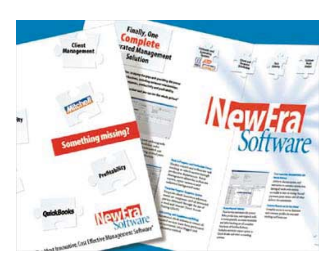
4-color brochure for NewEra Software