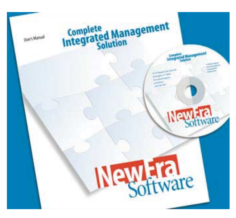
NewEra Software packaging and manual