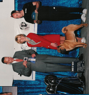
← "Wilma" Two Grand Sweeps