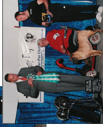
"Kitten" → 2 Best Veterans →