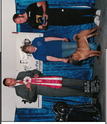
"Rhumba" BOS on Saturday →