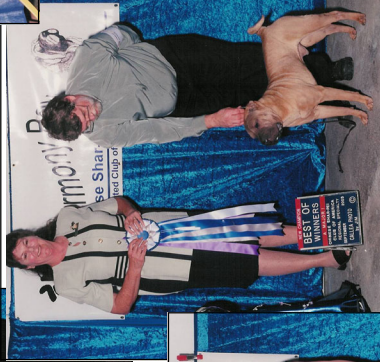
← Savanna, Two Best Juniors