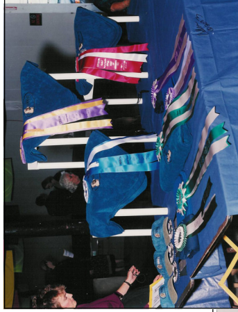
↑ Friday's Trophy Table New CH "Breezy" WB Friday, Best Bred By Exhibitor ↓