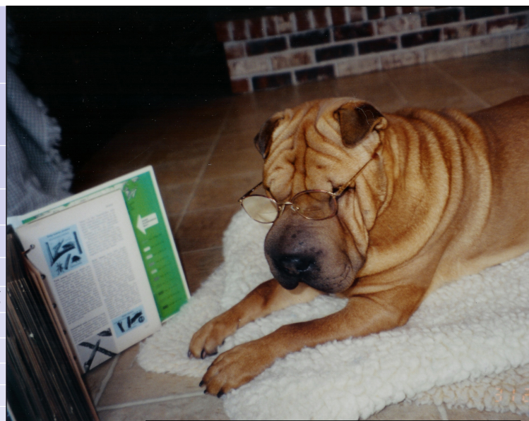
ShengLi Smuglrs Trout Fishin', CD, CDX

The children are allowed to select their own books, then settle in with their favorite therapy dog. Reading to therapy dogs has helped many children gain confidence and develop their reading skills. These types of programs are gaining in popularity throughout the United States as a valuable out-reach program to help those children that might not normally be exposed