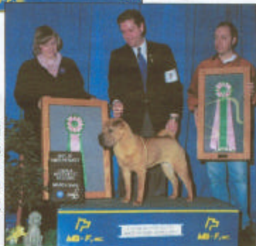
Grand Sweepstakes Puppy ▶ Toko's Something To Talk About