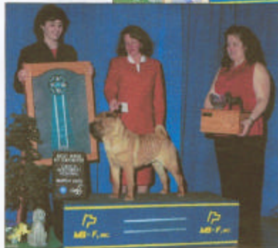
◀ Best Bred-By Exhibitor Flying Colors Meet Me In Xian