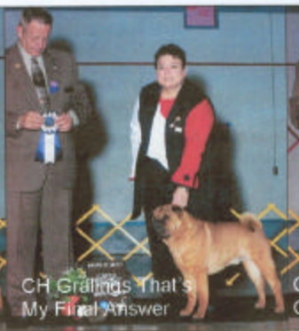
CH Gratings That's My Final Answer