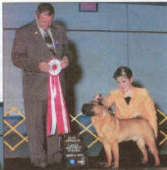
Best of Opposite Sex ▶ CH Rumples The Brave Just Do It