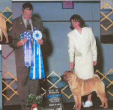
▲ Best Of Winners, Best Bred-By Exhibitor, Best Brushcoat Puppy Flying Colors Meet Me In Xian