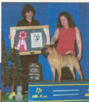
◀ Winners Bitch, Best of Winners WDR's Luci El Ball By Ruger