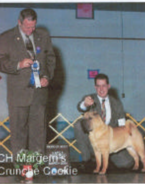
CH Margem's Crunchie Cookie