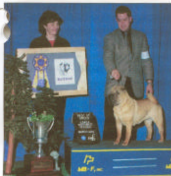
◀ Best of Breed CH Margem's Crunchie Cookie