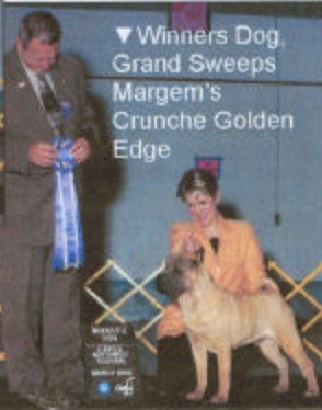
▼ Winners Dog Grand Sweeps Margem's Crunch Golden Edge