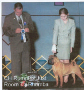
CH Rumples Just Room To Rhumba