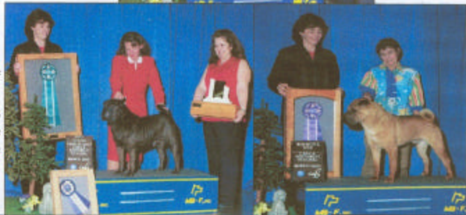
◀ Winners Dog Margem's Private Eye