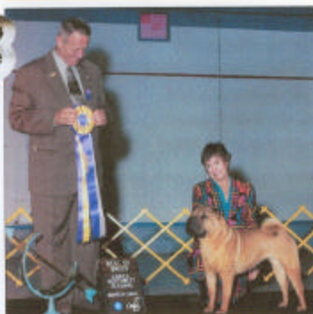
◀ Best of Breed CH Margem's Just A Gibson Girl