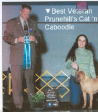
▼ Best Veteran Prunehill's Cat 'n Caboodle