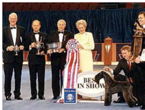
CH Torums Scarf Michael takes BIS at the AKC/Eukanuba Classic in 2002.