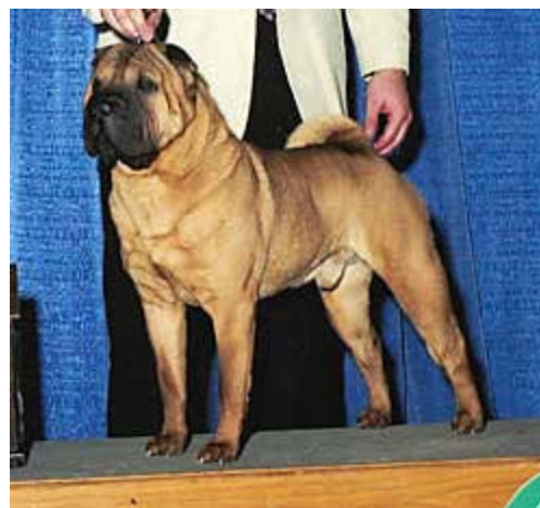
Gibson took BOB at the AKC Eukanuba Invitational!