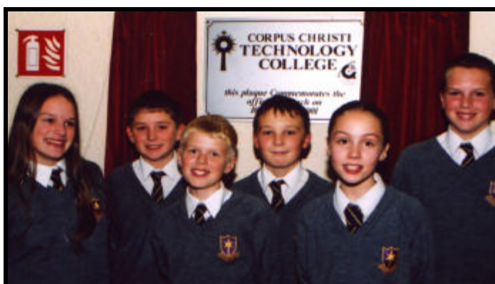
Pupils from Corpus Christ College unveil the new plaque.