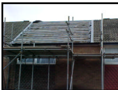
Work to the Levens on THMS/9 will be the last Estate Action Refurbishment on Halton Moor

The final phases of work on the Halton Moor Estate have taken shape over the past year and are due to finish with the Levens properties in early 2002. This will be the culmination of 10 years worth of improvement works where all of the estate has benefited from some sort of home improvements. £23 million has been spent raising the quality of your homes and surrounding environment.