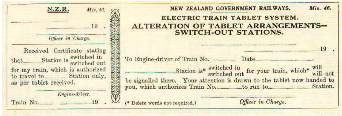
Mis 46 (1943 Rule Book)