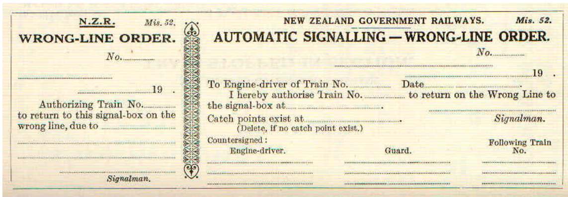
Mis 52 (1943 Rule Book)