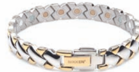
Two-Tone Link Bracelet (goldtone/silvertone) for men and women