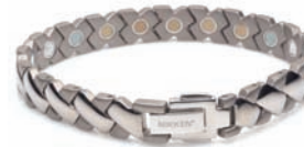
Titanium Link Bracelet for men and women