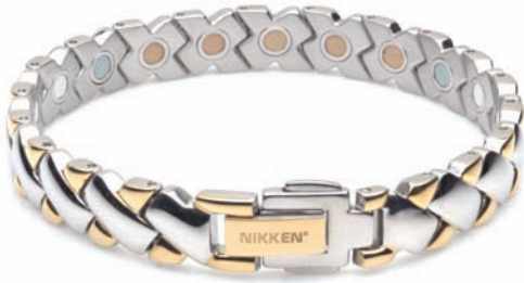
Two-Tone Link Bracelet (goldtone/silvertone) for men and women