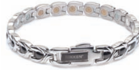
Women’s Braided Stainless Bracelet (black/silvertone)

Nikken dress bracelets with TriPhase Technology are available in four styles: