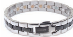
Men’s Classic Stainless Bracelet (black/silvertone)