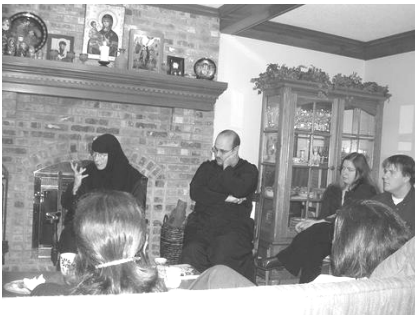
Bookclub at Fr. & Pres. Home