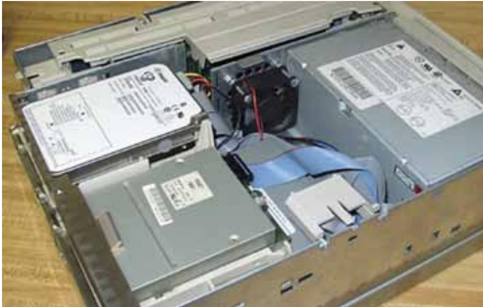
The fan installed

The 7500 has a XLR8 466/233MHz with 1 MB backside cache Processor upgrade.