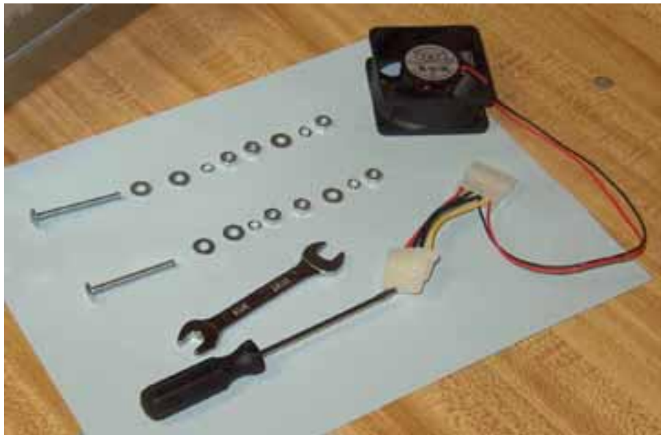
Tools and componets needed

Installation is easy: insert the screws into the small holes at the top of the frame. Place a flat washer and lock washer on the opposite end of the frame and use a nut to anchor the screws. Add a second nut to each screw turning the nuts toward the metal frame until