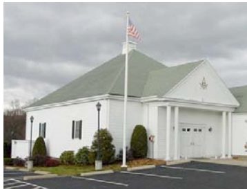
Westwood MA Prospect Lodge USA