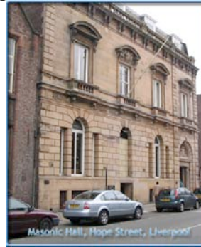
Liverpool Masonic Hall UK