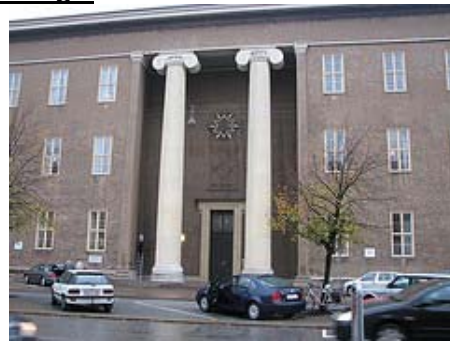
Grand Lodge of Denmark