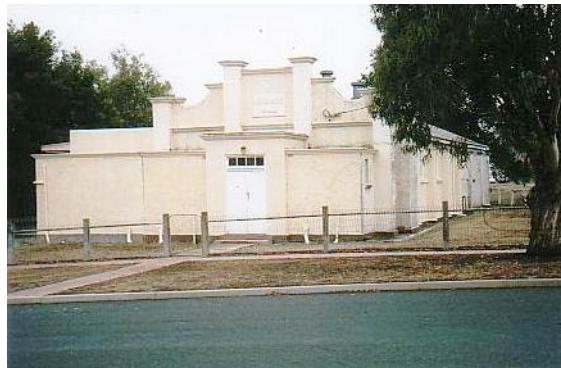
Lord Carrington Lodge Queensland

Please let me have Pictures of your Lodge Buildings. Keep them coming.