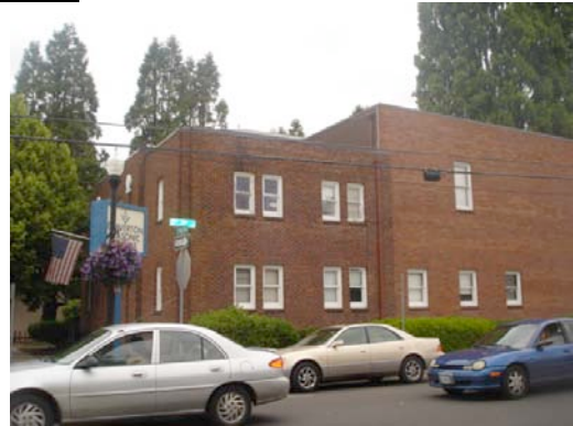
Beaverton Lodge Oregon