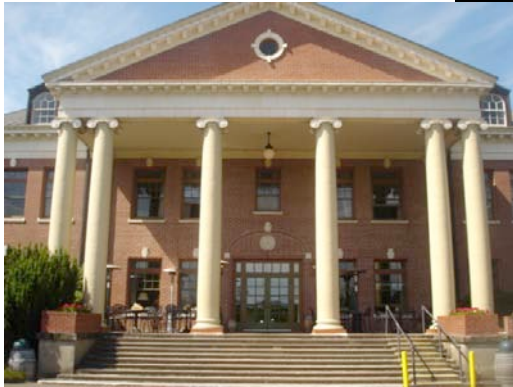
Grand Lodge of Oregon