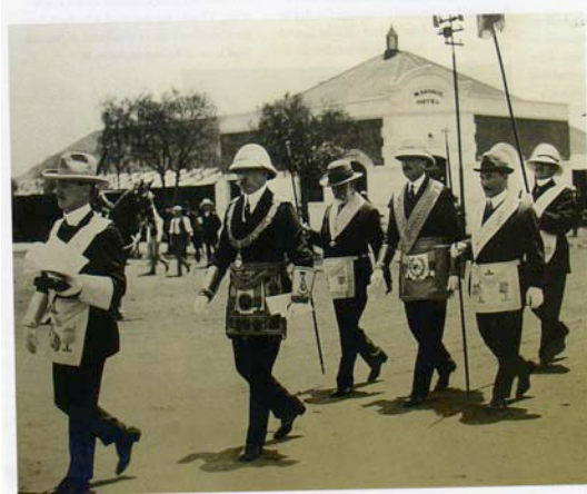
Duke of Connaught who was Grand Master of UGLofE from 1901 to 1939. Picture shows him in Rhodesia (now Zimbabwe) This from MQ Magazine

UK Forum. DO WE NEED IT? If you think we do come and join us Every Sunday at 9.0pm UK Time