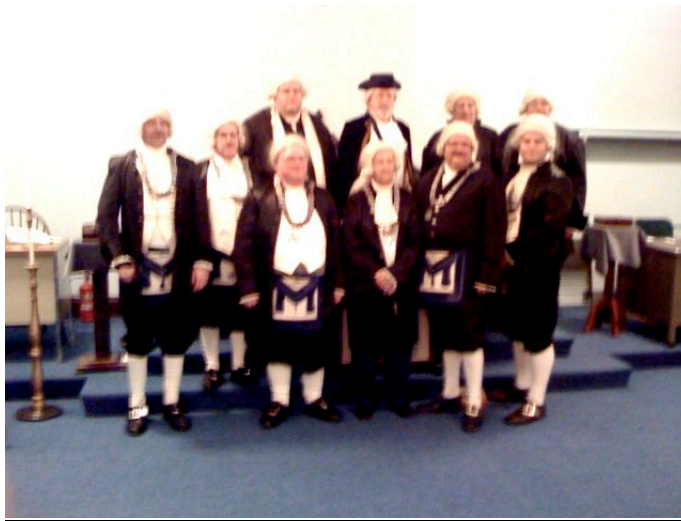
Steubenville Lodge No 45