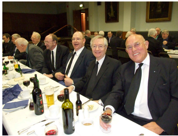
Before the Paddy Degree

On March 17 th some members of Crayford Lodge visited William Shannon Lodge No 373 in Belfast for St Patrick's Day