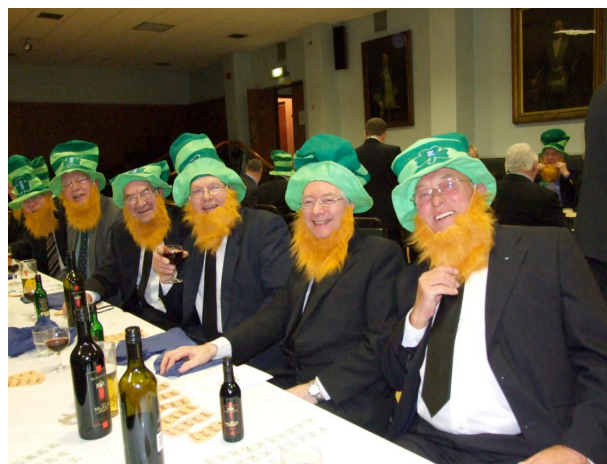
After the Paddy Degree