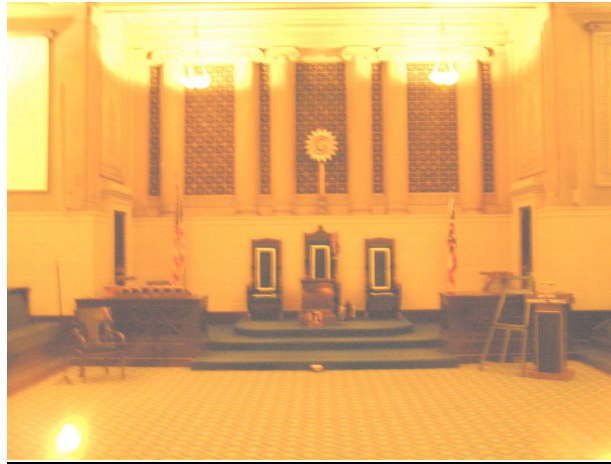
Solar Lodge Temple, Dayton, Ohio