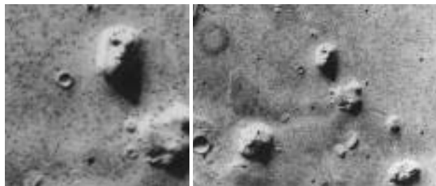
Face on Mars and the Cydonia Plane of Mars