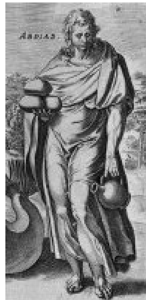
The Prophet Obadiah from a Medieval woodcut? by an unknown artist entitled "Prophets" depicting Isaiah, Jonah, and Obadiah.