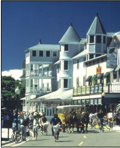
No motorized vehicles are permitted on Mackinac Island, where we went biking this summer.

Living in Wisconsin affords us many opportunities for entertainment and recreation. We had a lovely sailing trip in Milwaukee and drove around Lake Michigan on the Circle Tour, stopping off at Mackinac Island for the day. Concerts were aplenty and included Michael Buble, George Jones, Kenny Chesney, Gretchen Wilson, Brad Paisley, and Elton John. We are able to use our bikes more now that the landscape is flat and even rode from Manitowoc to Sturtevant in a grueling one-day trip over 70 miles – a bit longer than