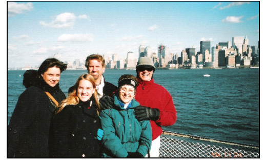
Family Trip to New York City for Thanksgiving 2004.