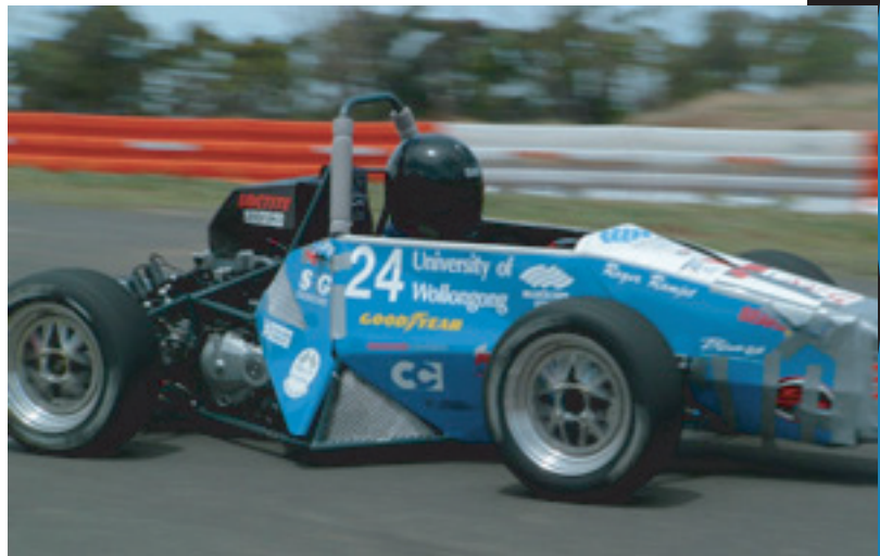
"Roger Ramjet" The UOW Racing F-Sae car in action on the autocross where he claimed 1st in Autocross and Endurance!

"SAE is a great opportunity for engineering students like me to see where your theory can take you. Until I joined the SAE team I thought I understood issues in design and implementation. Boy, was I wrong! You need to learn how to ask yourself why you are doing a certain thing a certain way. Just because that is how it was done in the past is simply not a good enough answer in the fast paced and ever-evolving, environment of F-SAE."