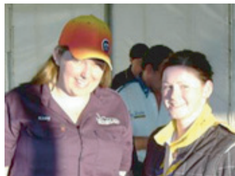
The upside of big weekends like this being found when the team gets to see the big boys race AND meet them!

The next stop was as a support category to the Konika Minolta V8 Supercars, also at Eastern Creek. Whilst not a championship round, it was an attempt to throw the team in the deep end with the big boys of motorsport. It turned out to be the perfect opportunity to learn about the heartbreaking lows of motorsport with only 1 race finish out of 3. The weekend taught the team alot about what was really required of a team member in even a grassroots level of motorsport.