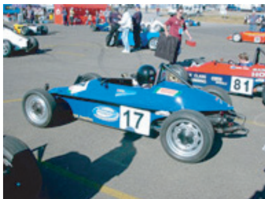
On the Dummy grid at the first race for Lasts and Lasts Motorsport at Eastern Creek

The first complete car and trailer package had been bought and tuned and the first training and practice days for the 2004. The team had it's sights set on the first round of the year at Wakefield park and everything was seeming to take shape. No sponsors on the horizon but a hopeful start to the year anyway.