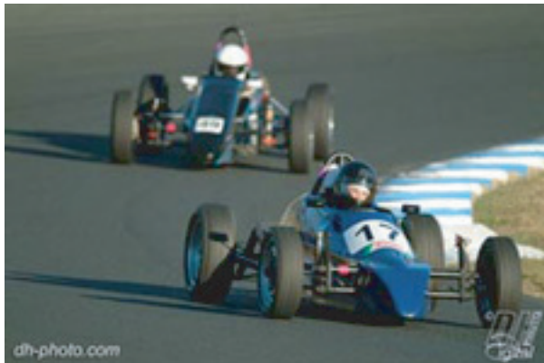
The Lasts and Lasts Motorsport NG Elfin on it's first outing in a race round at Eastern Creek