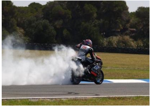
...and the burnouts