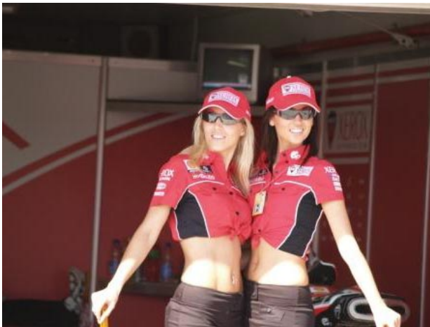
Brolly bints posing