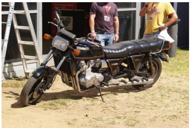
Stretched Limo Kwaka