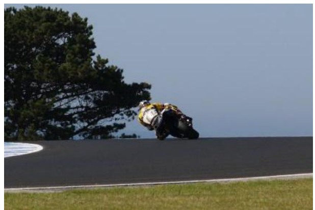
Someone on the horizon on a new Yammie