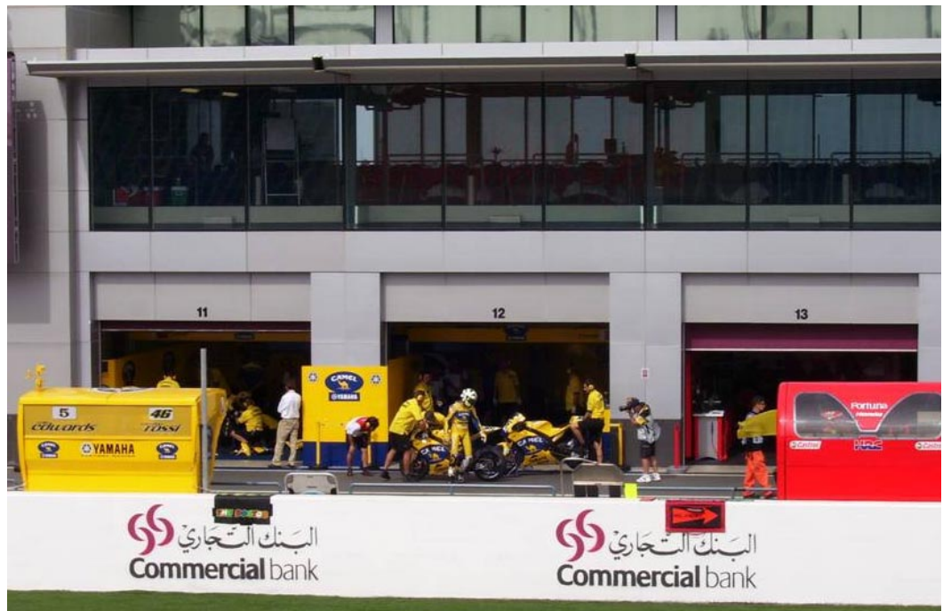
Val finally found some friends