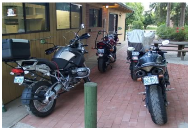
Bikes at Mt Beauty