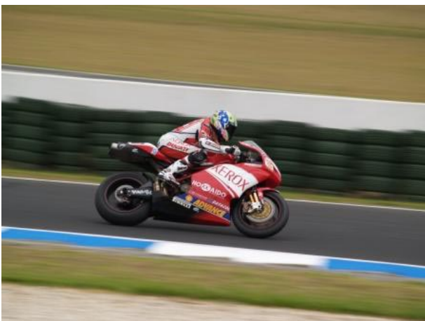
Troy Bayliss practising