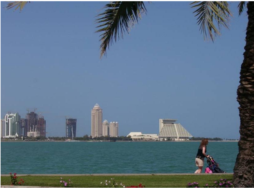
Geezus... who'd want to live there