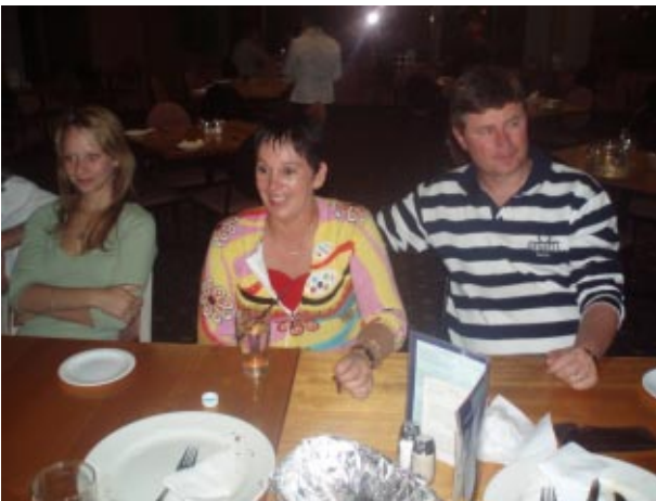
Lowens – dreaming of deserts not desserts