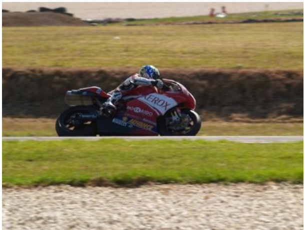
Troy B cruises to a win in race 2