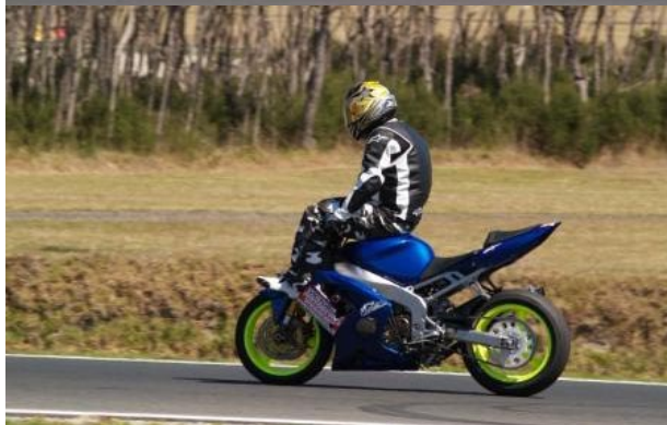
This'll get you...