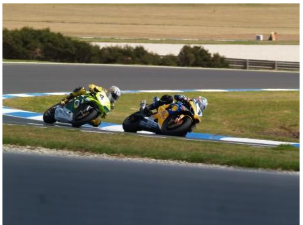
Troy Corser and Alex Barros – 1 and 2 in race 1