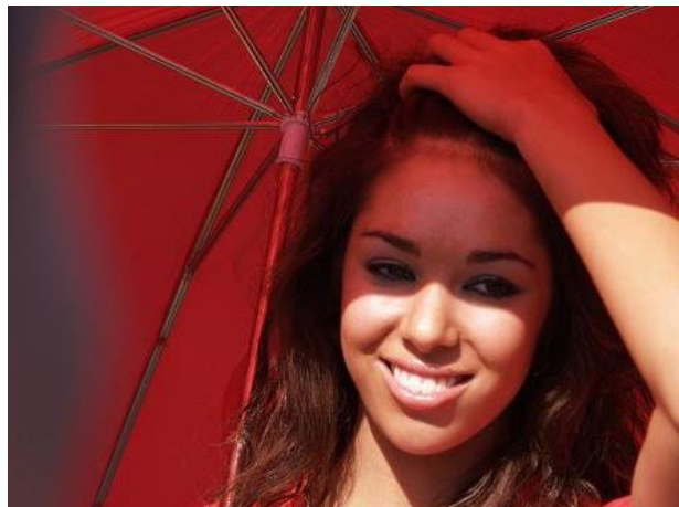
She thought she was pretty special. So did most of the blokes at the Island.