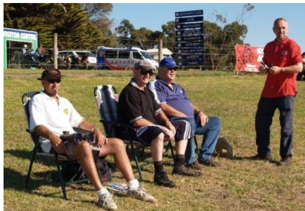
The boys settling in