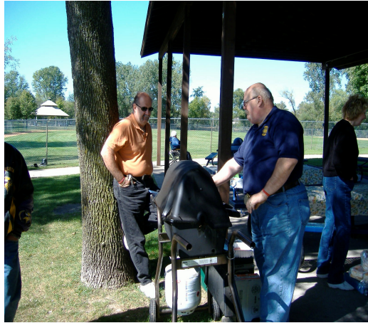
Lion Hood and Lion Slinder