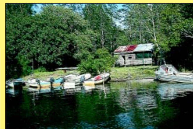
Fishing hut, Myall River

FUEL is available at Tea Gardens and Bulahdelah. A container will have to be taken ashore at Myall Shores to get petrol. Petrol and diesel are available from the Bungwahl General Store, but it will have to be carried in a container one kilometre each way along the road. Travelling from Nelson Bay to Bungwahl and return will require fuel for about one hundred nautical miles.