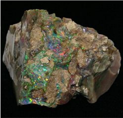
Multi-color rough opal specimen from Virgin Valley, Nevada, USA

Fire opal is found mostly in Mexico and Mesoamerica. In South America opal discovered in 1930 in a city called Pedro II in Brazil is still produced. In Honduras there was also some fine black opal mined from volcanic ash deposits. This opal is known for its stability.