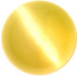
Fine color Cymophane with a sharp and centered eye.

Translucent yellowish chatoyant chrysoberyl is called cymophane or cat's eye . Cymophane has its derivation also from the Greek words meaning 'wave' and 'appearance', in reference to the chatoyancy sometimes exhibited. In this variety, microscopic tubelike cavities or needlelike inclusions of rutile occur in an orientation parallel to the c-axis producing a chatoyant effect visible as a single ray of light passing across the crystal. This effect is best seen in gemstones cut in cabochon form perpendicular to the c-axis. The color in yellow chrysoberyl is due to Fe^{3+} impurities.