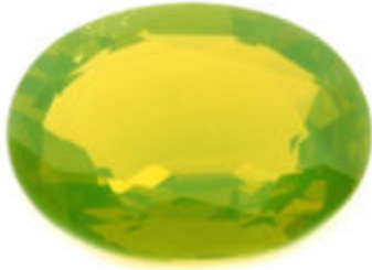
Yellow chrysoberyl gemstone featuring oval step cut.

Chrysoberyl was discovered in 1789 and described and named by Abraham Gottlob Werner, in 1790. Werner worked at the Freiberg School of Mining from 1790-1793 and was well known as one of the most outstanding geologists of his time. He is best known today as the loser in the battle of the Neptunists and Vulcanists that raged in the 1780s.