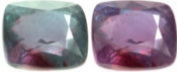
Alexandrite step cut cushion, 26.75 cts. Alexandrites this large are extremely rare.

The alexandrite variety displays a color change ( alexandrite effect ) dependent upon light, along with strong pleochroism. Alexandrite results from small scale replacement of aluminium by chromium oxide, which is responsible for alexandrite's characteristic green to red color change. Alexandrite from the Ural Mountains in Russia is green by daylight and red by incandescent light. Other varieties of alexandrite may be yellowish or pink in daylight and a columbine or raspberry red by incandescent light. The optimum or "ideal" color change would be fine emerald green to fine purplish red, but this is exceedingly rare. Because of their rarity and the color change capability, "ideal" alexandrite gems are some of the most expensive in the world.