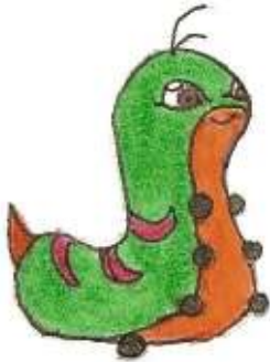
Name: Elvis Species/Default File Name: Catapillar.mid