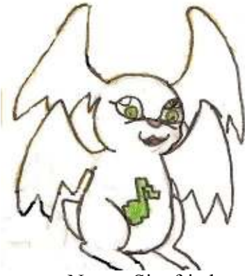
Name: Siegfried Species/Default File Name: Snowgoose.mid