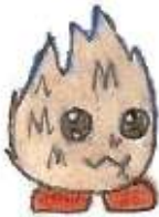
Name: Earnest Species/Default File Name: Troll.mid