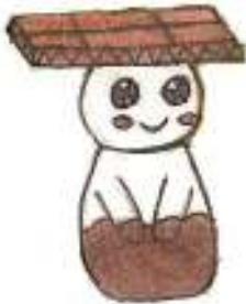
Name: Zippy Species/Default File Name: Smore.mid