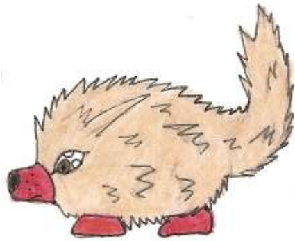
Name: Pembroke Species/Default File Name: Furcupine.mid