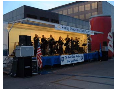
The "Showmobile" will be our Main Stage.

Our Indian Village will feature three tipis and a large council ring for performers.