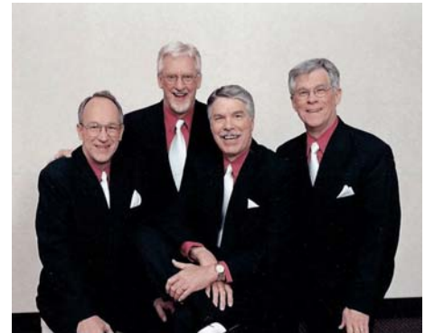
Yesterday's Heros nationally acclaimed barbershop quartet

Tags on Coors summer radio ads Co-op promotions with Coca Cola Chapel Hills Mall display week prior to event Territory Days Booth Spring Spree Leaflet Distribution KKTV News 11 support Numerous web based calendar listings Co-op website links BBB event notice e-mail and fax broadcasts Flyer distribution at many "Friends" locations