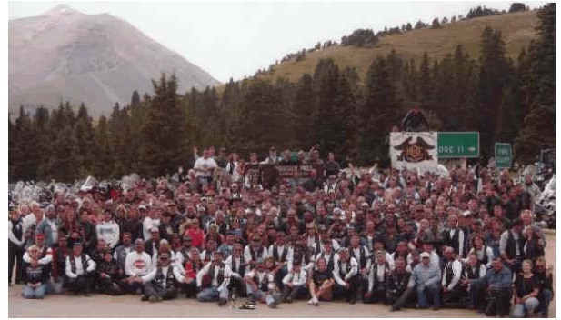
The Pikes Peak Harley Owners Group, longtime Christmas Unlimited supporters, are helping with the PPBBQF.

The Kansas City Barbecue Society has sanctioned this event. It is the country's oldest and most prestigious barbecue organization.