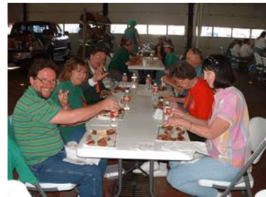
Sponsors will be invited to participate in judging.