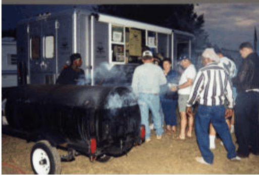
Smokn' good eatn' at the KCBS sanctioned Fountain, CO BBQ.