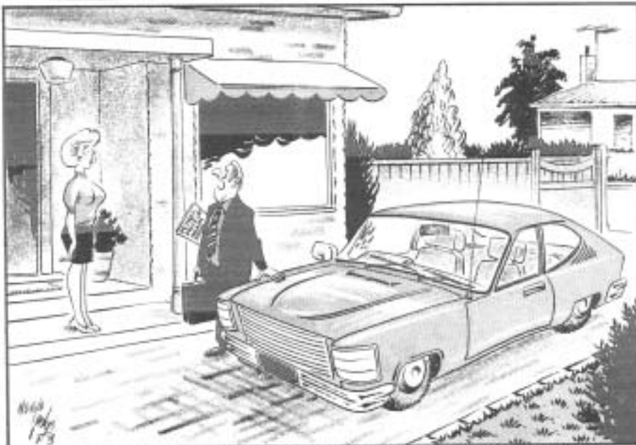
"IF I'M GOING TO BE ABLE TO AFFORD TO KEEP RUNNING THIS THING, I'M GOING TO HAVE TO CUT EXPENSES SOMEHOW, SO HOP IN AND I'LL DRIVE YOU BACK HOME TO YOUR MOTHER."