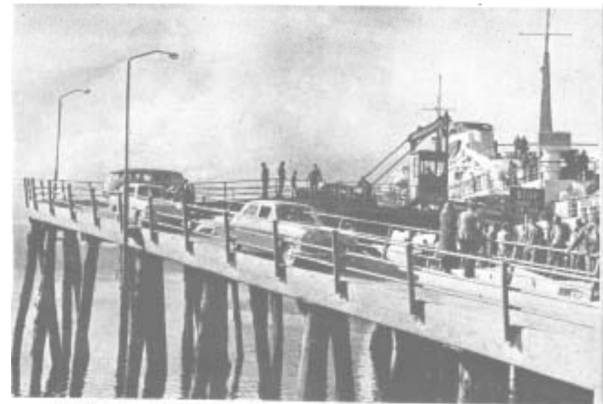
The unloading of 28 cars at Picton took only four minutes. The gangway to the ramp is operated from the cabin near the right.

These are Pictures from the inaugural voyage of the interisland ferry service between Wellington and Picton.