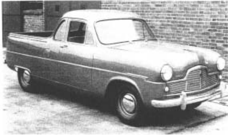
Prototype Australian MKI Zephyr Ute

Note the purpose built side panels, 2 piece rear window and relocated fuel filler. This was a serious pre production vehicle not a quick evaluation mock up.