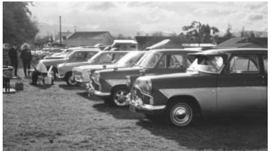
Picnic lunch at Fairlie