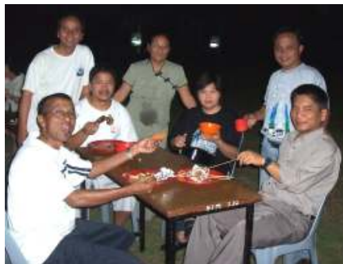
Photo: Participants enjoying the Closing BBQ Dinner