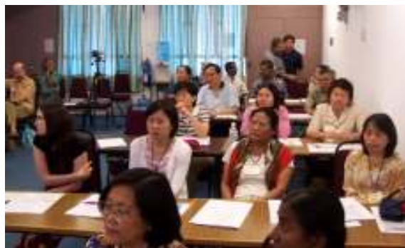
A section of the participants during a Consultation session