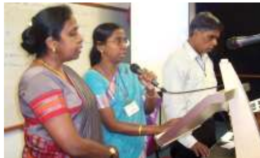
Participants from India leading Morning Worship