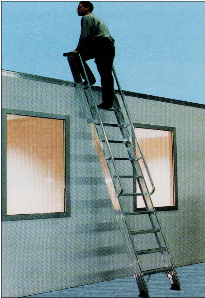
Aluminium ladder for roofs. Steps cm 10.