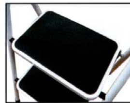
PP Slip-resistant surface