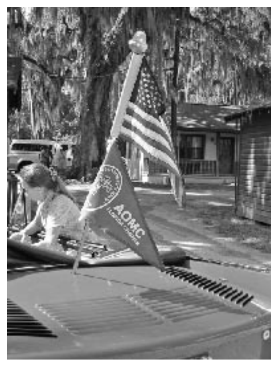
AOMCI and USA... what a combination !!