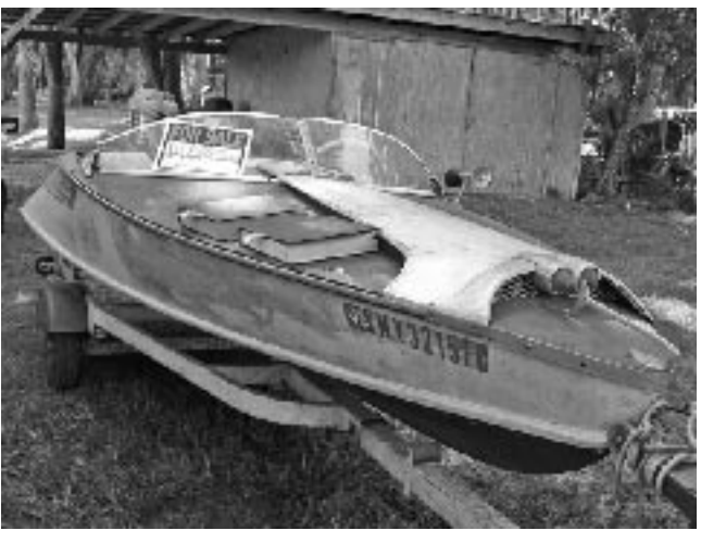
Won't someone please take this Aristocraft home??