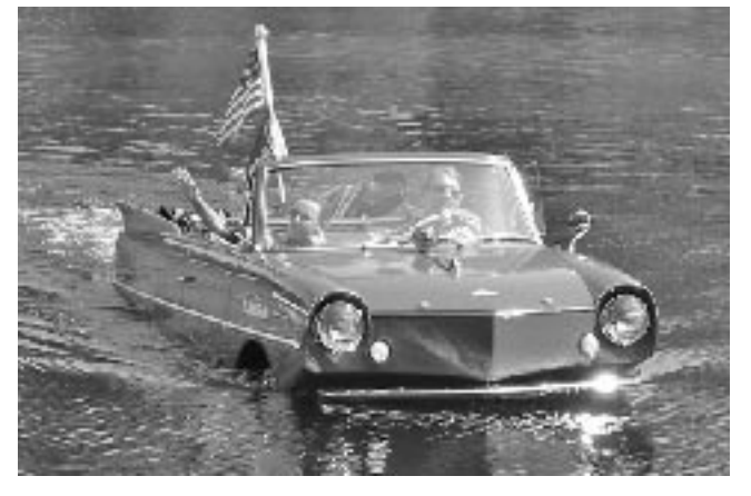
Amphicar owned by Tommy Sciortino