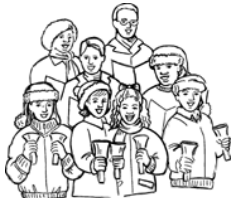
Here's Living Caroling