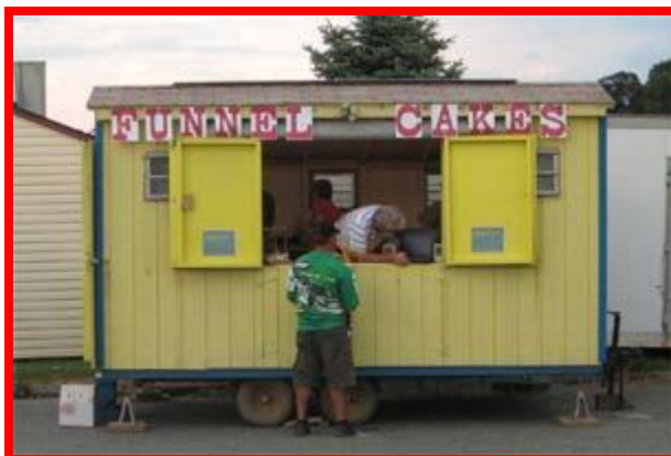
Here is the Fair Pizza Stand converted into a Funnel Cake Stand