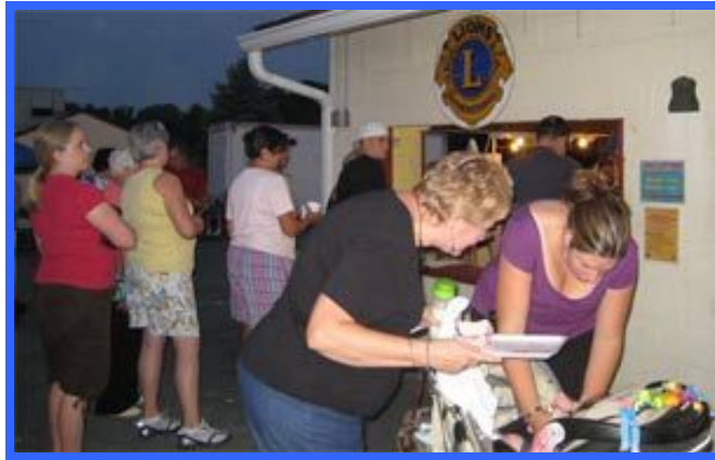
The Crowd lines up at the Pizza Stand