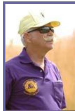
And he watches it fly away!