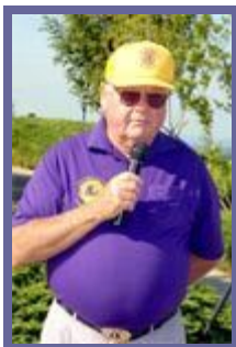
Last minute instructions before the shotgun start!