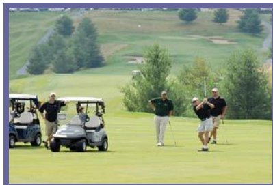
A foursome approaches the green!