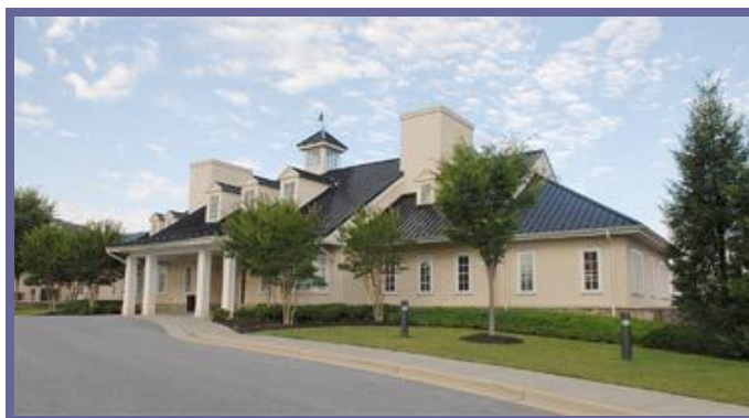
Musket Ridge Golf Club, Site of The Liberty Open Golf Classic