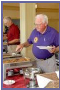
Lion Harry helps himself at the Buffet!