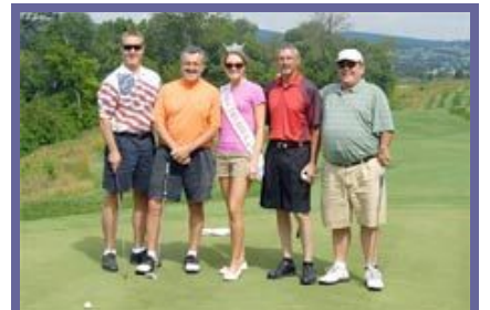
Miss Frederick posed with all the golfers during the day.