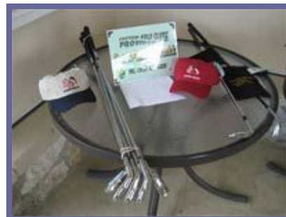
Display of items given to lucky golfers with winning tickets