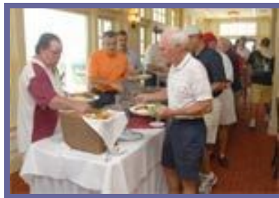
Tired and hungry golfers fill their plates at the buffet!