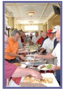
And some came back for seconds!