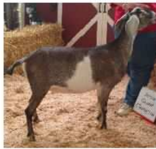
Fancy Colors Silver Shimmer