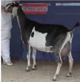
CH Little-Shepherd Cupcake LA2005 89 V+VE