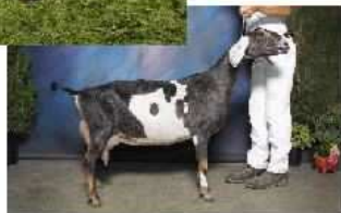
Paradise, Landy's maternal great granddam