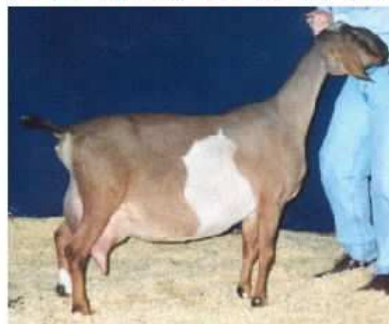
CH Little Shepherd Oda Mae Brown

This is a picture of OJ as a milking yearling where she was Grand Champion Sr. Doe at the 1999 Ohio State Fair Jr. show. I wish I had a better picture of "OJ" to share her wonderful general appearance, body capacity and dairy character, not to mention her nicely attached very capacious mammary. OJ is a combination of the two Little Shepherd does I truly admire and that is Cranberry and Oda Mae. My only regret about this doe is that she has had two substantial leg injuries, one from birth and one from giving birth, that prevent her from being in the show ring to prove herself.