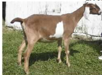
LA 6/06 VW

Camilla is our 2006 ODGA Buckeye Sale consignment. In my very humble opinion, (while she didn't LA as high as her sister, her score is certainly nothing to be ashamed of) she will have the better mammary of the two does. We'll have to wait until March of 2007 to see though, as she and her sister are both linebreed to Fancy Colors Nostalgic Norman. We are going to miss her greatly when she leaves the farm to go to her new home but we'll be keeping our eye on her in the future. Please see her sale brochure or contact us if you are interested in adding her to your herd.