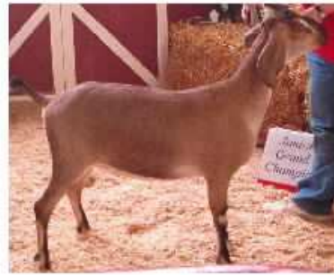
Willow Run Seraglio Nori

Thank you to all of those who have helped our breeding program with their knowledge, genetics, encouragement, support and purchases. We appreciate all of you tremendously, and look forward to making more new acquaintances as we continue throughout this dairy goat journey.