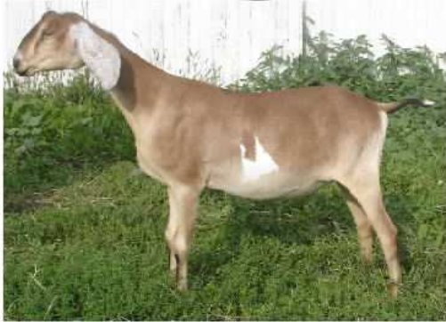
LA 6/06 EcEcEc

Ruth is our 2002 Buckeye Sale purchase, and she's definitely repaid us for her investment. She's given us some beautiful offspring. Not to overlook Shirley's paternal contributions. Of course, her LA score speaks volume's for this doeling. She is linebreed to Fancy Colors Nostalgic Norman and you know we just can't wait for those kid's to hit the ground! Shirley's been shown 8 times this year placing 1st or 2nd each time shown, battling with her herdmate Fancy Colors Shimmer Cappacino for the blue. We look forward to Shirley getting her CH early in her show career and providing us with lots of wonderful offspring to carry on these lines.