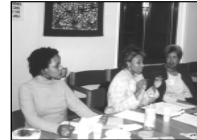
The Youth Alliance Advisory Board meets monthly at the Harvard International Institute (Coolidge Building) in Cambridge.