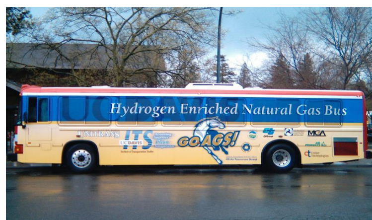
Davis Wiki Org