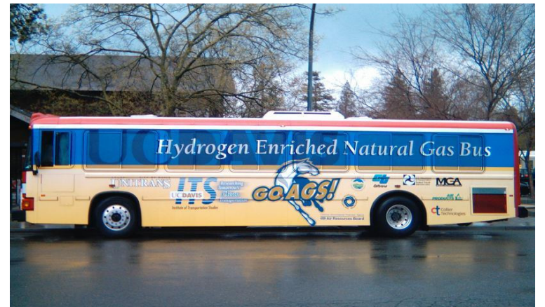
Davis Wiki Org