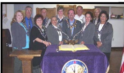
Lodge #408 2007-2008 Officers